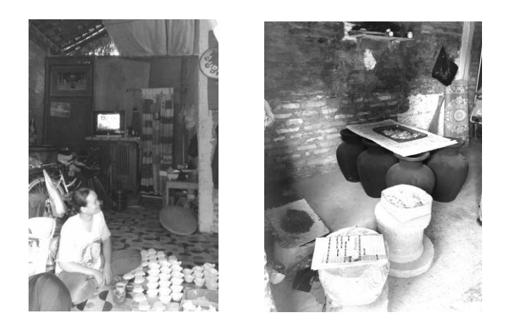
Figure 4. Inhabitant create pottery handcraft in their own houses

The current development or transformation of core houses receives a positive response from the occupants. Various forms of transformed core houses reflect their various needs, capabilities, and priorities. Therefore, the transformed core houses have various roles and capabilities in fulfilling the occupants' needs. Within the framework of Maslow's hierarchy of needs, basically the occupants gave positive response toward fulfilment of the needs by the current house form. An important point in post-disaster housing reconstruction program is concern with the development of core houses that could also support the recovery in family's economic condition. There were people who worked as pottery craftsman in their houses before the earthquake in Kasongan village. Through the implementation of core houses as an in-situ housing reconstruction, the craftsman could immediately return to conduct their economic activities of creating pottery to support their livelihood (Figure 4). Therefore, their economic aspect as craftsman can also immediately be restored.