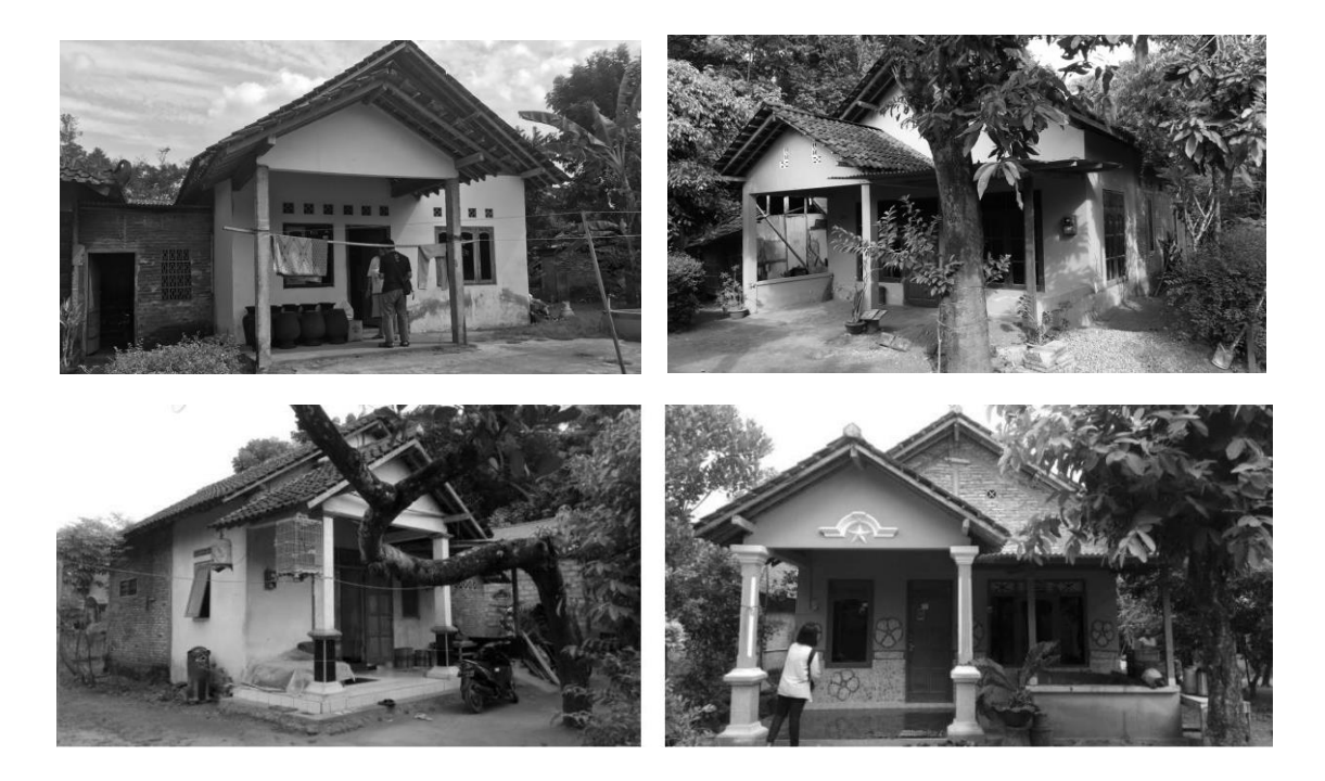
Figure 3. Core houses that have been transformed by the occupants

The core houses receive positive response from the beneficiaries. The occupants satisfy with the core houses because they can receive support after the disaster struck. However, the point of strength and fast