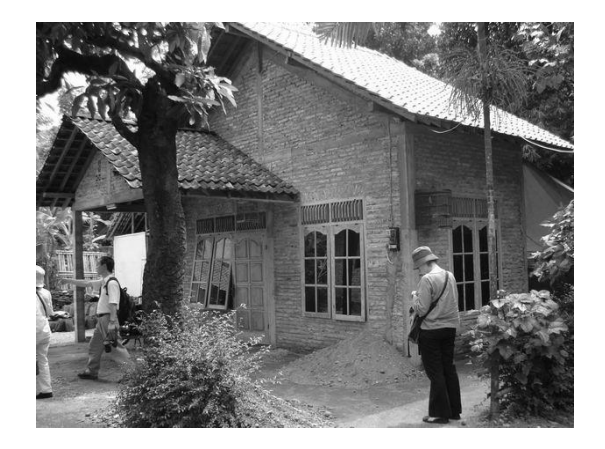
Figure 2. In-situ core house as one type of post disaster housing reconstruction program

Various post-disaster housing reconstruction programs were delivered in Kasongan Village. One of the housing reconstruction programs was in the form of donation of core houses from the Bengkulu Province. This program was one type of housing reconstruction implemented right after the disaster with the form of in-situ reconstruction (Figure 2). Core house was starter house that could be occupied immediately and then developed incrementally along with the occupants' need and capability. The core house was developed in the former lot of the beneficiary. It had 18-m<sup>2</sup>-floor area with a gable roof style. Stone foundation and concrete steel column were used in the construction with bricks wall and roof tile from clay.