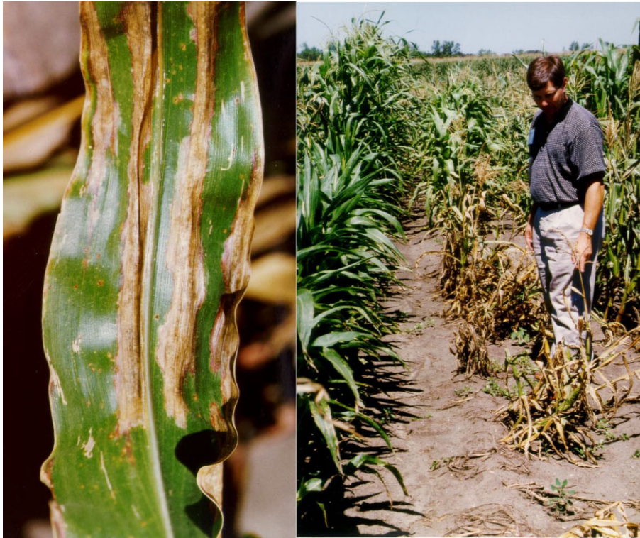
Figure 1: Left-hand panel: symptoms on maize leaves that show traces of insect bites. Right-hand panel: susceptible maize lines showing heavy dwarfing compared to neighbouring less susceptible lines (both pictures taken in Iowa, USA, and kindly provided by David Caffier, INRA)

The bacterium is seed-borne, seed playing an important role for long-distance dissemination (Block et al., 1998). However, no information was found on how P. s. subsp. stewartii colonises seedlings from infected seeds. Seed-to-seedling transmission has been observed even though the transmission rate is very low (e.g. less than 0.06% for seed with less than 10% infected kernels) (Block et al., 1998).