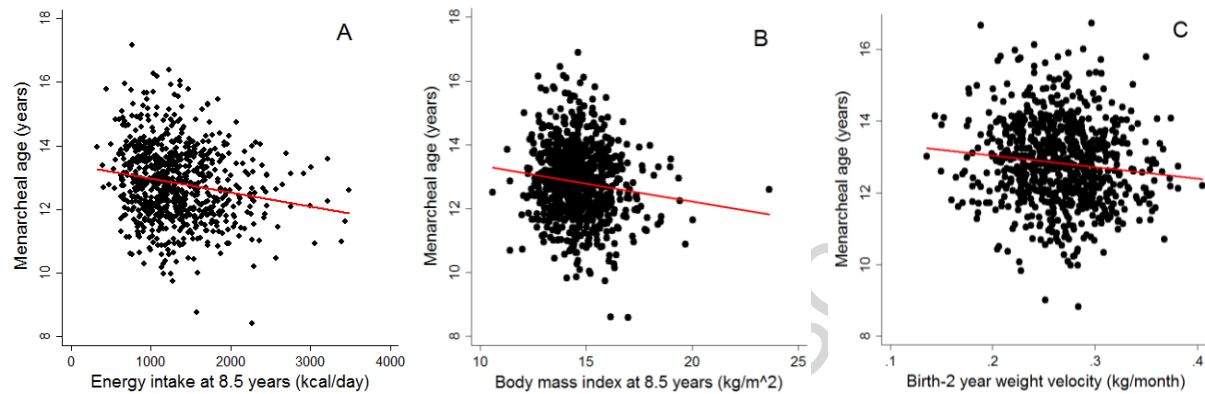
Fig. 1 Relationships between menarcheal age and A) energy intake during childhood (8.5 years), B) body mass index during childhood (8.5 years), and C) infancy weight velocity (birth-2 years). All significant at p < 0.0001 . Relationships were derived from the fully-adjusted model (Table 2, Model 4) that included childhood energy intake, infancy weight velocity, gestational age-adjusted birth weight, childhood energy intake, sibling death, paternal instability, maternal instability and maternal age at menarche (see Section 2. Methods).