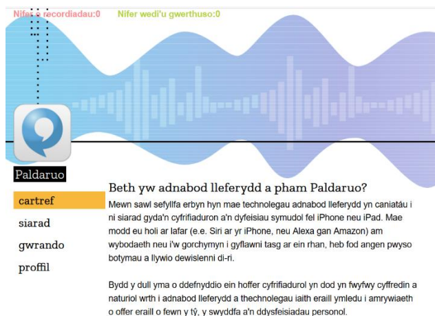
Figure 1 - Screenshot of CommonVoice website at http://paldaruo.techiaith.cymru to crowdsource Paldaruo

We also embraced the CommonVoice software in order to expand the Paldaruo corpus via a website and to understand how Mozilla's approaches could be scaled-down and made impactful for lesser resourced languages. Figure 1 shows a screenshot of our offering at http://paldaruo.techiaith.cymru , with Welsh language text. This translates as "What is speech recognition and why Paldaruo?" with a short explanation on its increasing importance and its ubiquity e.g. in personal devices.