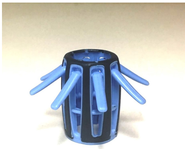
Figure 1 Endocuff Vision.

It consists of a fixed portion and a row of eight soft projections, which fold backwards during insertion but are pulled forwards during withdrawal to hold back colonic folds. EV is a second-generation device replacing the original Endocuff which had two rows of shorter, firmer projections. The original Endocuff (figure 2) demonstrated an improvement in ADR in some studies but this was not replicated in a large randomised controlled trial (RCT). 15 16 The