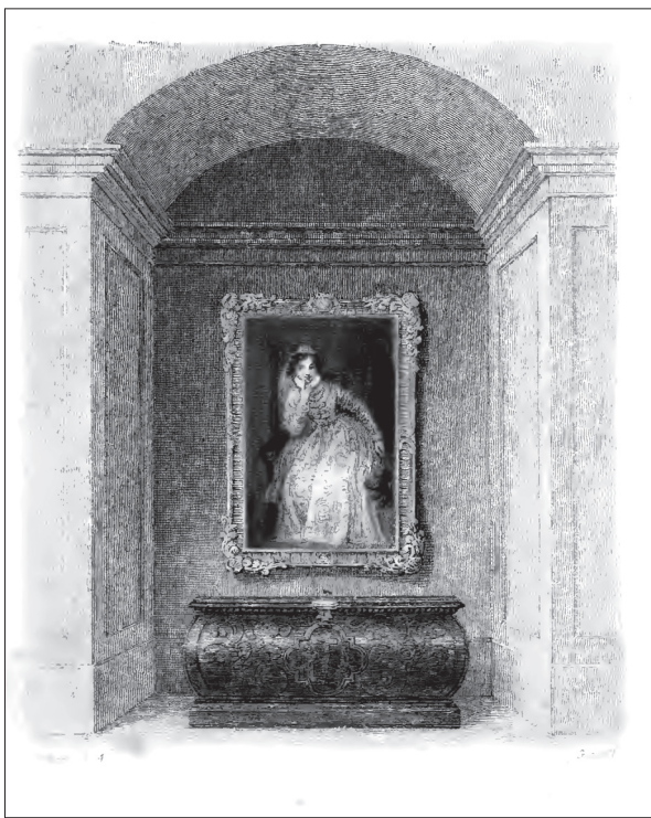
FIG. 2. THOMAS STOTHARD, 'GINEVRA', IN SAMUEL ROGERS, ITALY (1830)

In Italy , Rogers describes the statues as the ghosts of the Medici princes, cloaked in shadow. He focuses primarily on Lorenzo's scowl, saying that it is fascinating yet intolerable. Although disturbing, the narrator quickly moves on