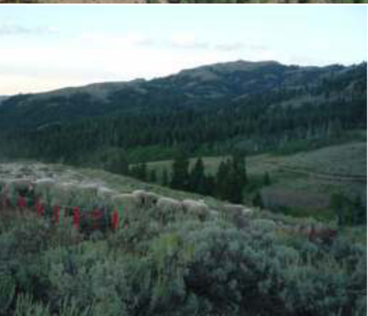
Main picture: Pete howls to the wolves Left: Sheep in a fladry night corral Below: A wolf-tracker's kit