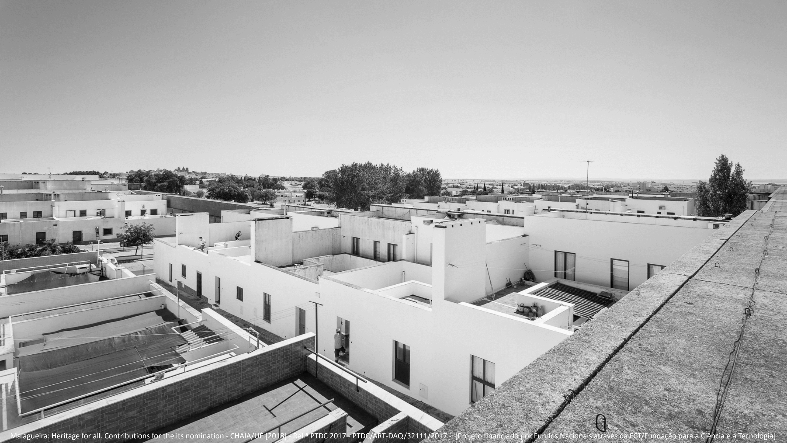
Malagueira: Heritage for all. Contributions for the its nomination - CHAIA/UE [2018] - Ref.º PTDC 2017 - PTDC/ART-DAQ/32111/2017 - [Projeto financiado por Fundos Nacionais através da FCT/Fundação para a Ciência e a Tecnologia]