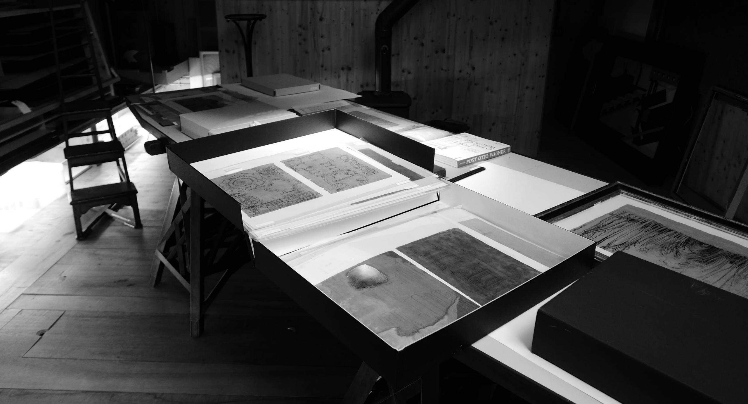
Malagueira: Heritage for all. Contributions for the its nomination - CHAIA/UE [2018] - Ref.ª PTDC 2017 - PTDC/ART-DAQ/32111/2017 - [Projeto financiado por Fundos Nacionais através da FCT/Fundação para a Ciência e a Tecnologia]