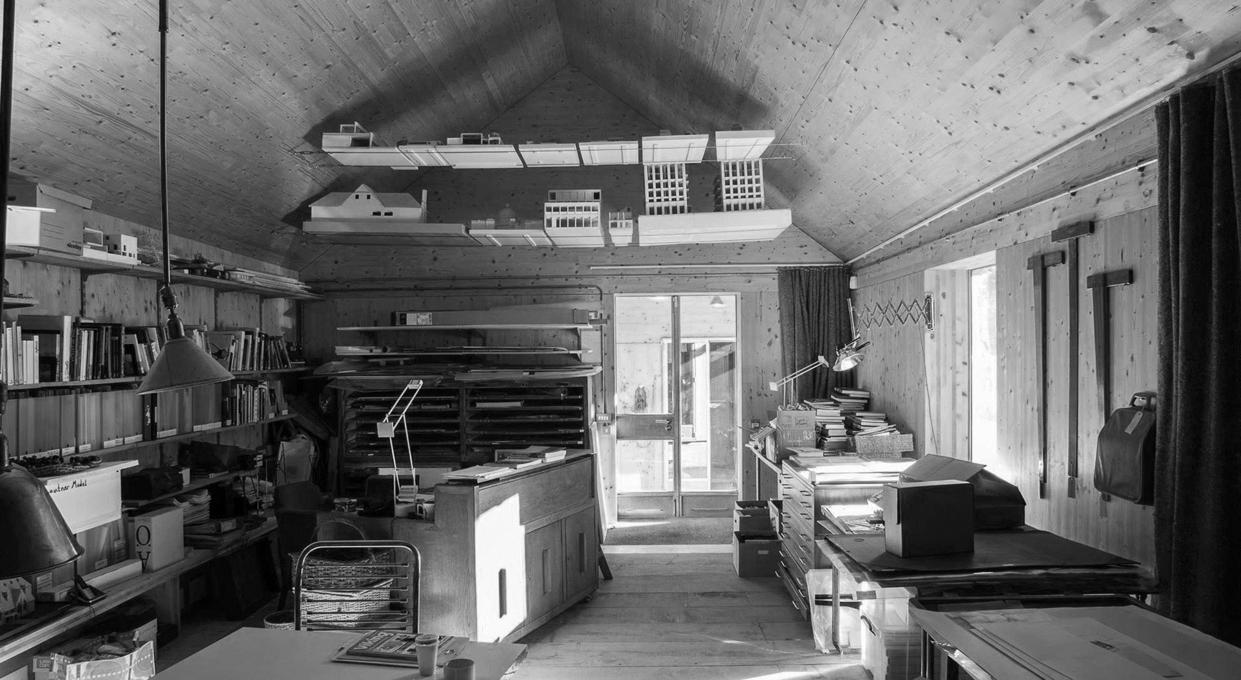
Malagueira: Heritage for all. Contributions for the its nomination - CHAIA/UE [2018] - Ref.ª PTDC 2017 - PTDC/ART-DAQ/32111/2017 - [Projeto financiado por Fundos Nacionais através da FCT/Fundação para a Ciência e a Tecnologia]