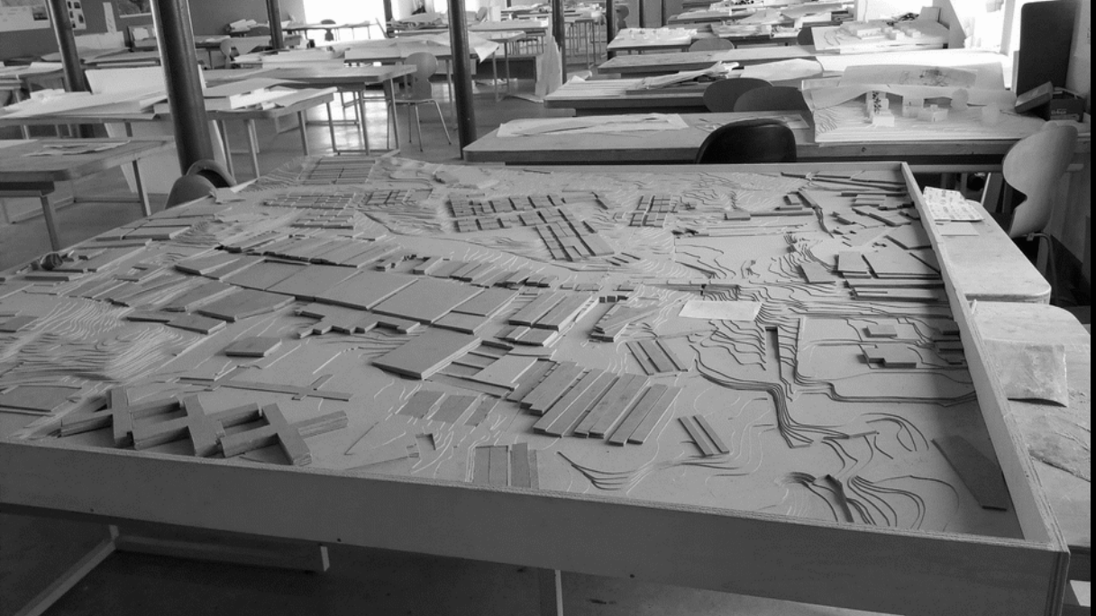
Malagueira: Heritage for all. Contributions for the its nomination - CHAIA/UE [2018] - Ref.ª PTDC 2017 - PTDC/ART-DAQ/32111/2017 - [Projeto financiado por Fundos Nacionais através da FCT/Fundação para a Ciência e a Tecnologia]