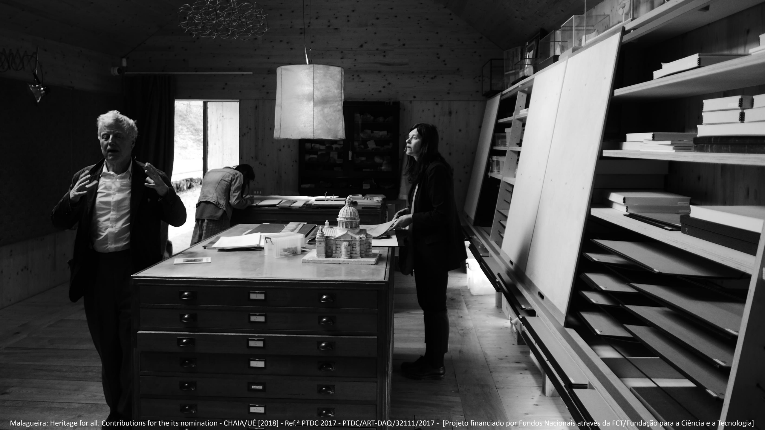
Malagueira: Heritage for all. Contributions for the its nomination - CHAIA/UE [2018] - Ref.ª PTDC 2017 - PTDC/ART-DAQ/32111/2017 - [Projeto financiado por Fundos Nacionais através da FCT/Fundação para a Ciência e a Tecnologia]