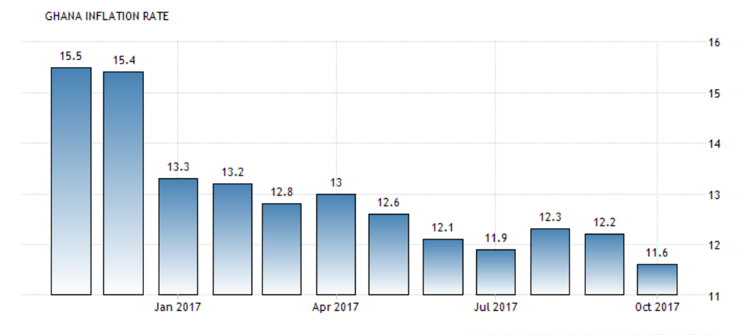
\textbf{Figure 1} \textbf{ -} Inflation \ Rate \ of \ Ghana \ from \ January - October, \ 2017