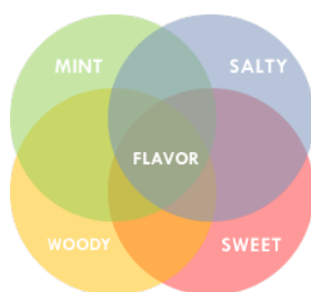
FIGURE 3: Flavor experiences are realized by olfactory and gustatory experiences.

When you have a flavor experience, are you in a position to identify its gustatory and olfactory realizers? Consider, for example, the flavor experiences induced by “ripe mangoes, fresh figs, lemon, canteloupe melon, raspberries ... green olives, ripe persimmon, onion, caraway, parsnip, peppermint, aniseed, cinnamon, fresh salmon.” 16 Even careful introspection does not reveal what the phenomenal realizers of those experiences are. In fact, oftentimes flavor experiences might seem simple and unstructured. This point is well articulated by Smith [2013] when he says that even though flavor perception is multimodal, flavor experiences “can strike us as whole, unified percepts,” and “on the basis of that phenomenology, we are often unable to distinguish the sensory components that feed into such experiences.”