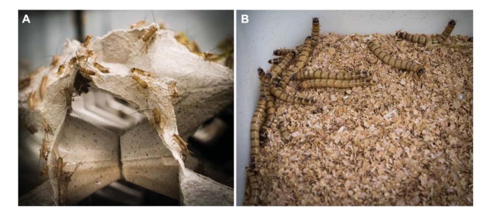
Figure 1. Crickets Acheta domesticus (A) and Yellow mealworm Tenebrio molitor (B) reared as feed for reptiles and birds in the zoo.

of up to 50–60% of individuals rearing grasshoppers (Pener 2014; Lopata et al. 2005) or silkworm (Uragoda and Wijekoon 1991). Allergenicity also has to be considered in the domestic context. A rather new development is the acquisition of reptiles as pets in homes, which are fed live grasshoppers, and here the owner has to consider the sensitization potential via the lung or skin (Jensen-Jarolim et al. 2015).