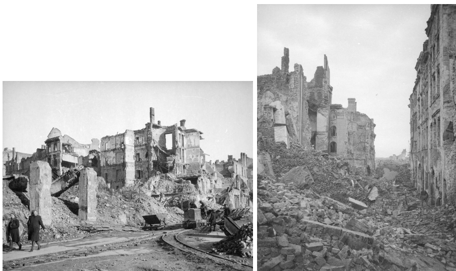
FIGURE 4. Warsaw after bombardment.

1.3.1. 1939 is regarded as the last year of the WSL. Twardowski and Leśniewski died before 1939. The invasion of Poland by Germany on 1 September 1939 and by the Soviet Union on 17 September 1939 began the Second World War. Poland was again divided, under the Nazi-Soviet pact of 23 August 1939. Warsaw was completely destroyed. Many key members of the L-WS were forced to leave Warsaw.