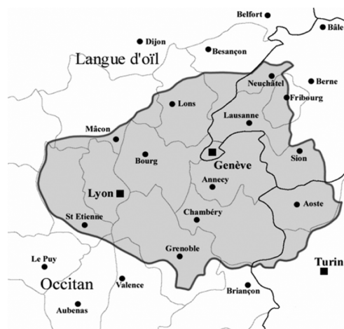
Figure 1 Francoprovençal-speaking zone

Francoprovençal is the glottonym assigned by linguists to a RML spoken in parts of France, Switzerland, and Italy. Within France, the territory over which Francoprovençal is spoken stretches across the départements of the Loire, Rhône, Ain, Isère, Savoie, Haute-Savoie, parts of Jura and Franche-Comté, as well as in isolated parts of the Lyon metropolitan area—particularly the surrounding peri-urban regions of les monts du Lyonnais and in some small communes to the East of the city—and Geneva (Figure 1).