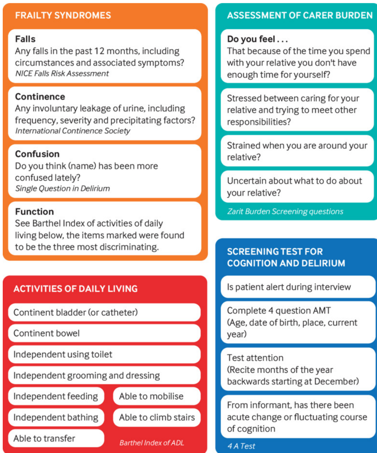
Fig 2 Some practical tools for assessment of an older adult