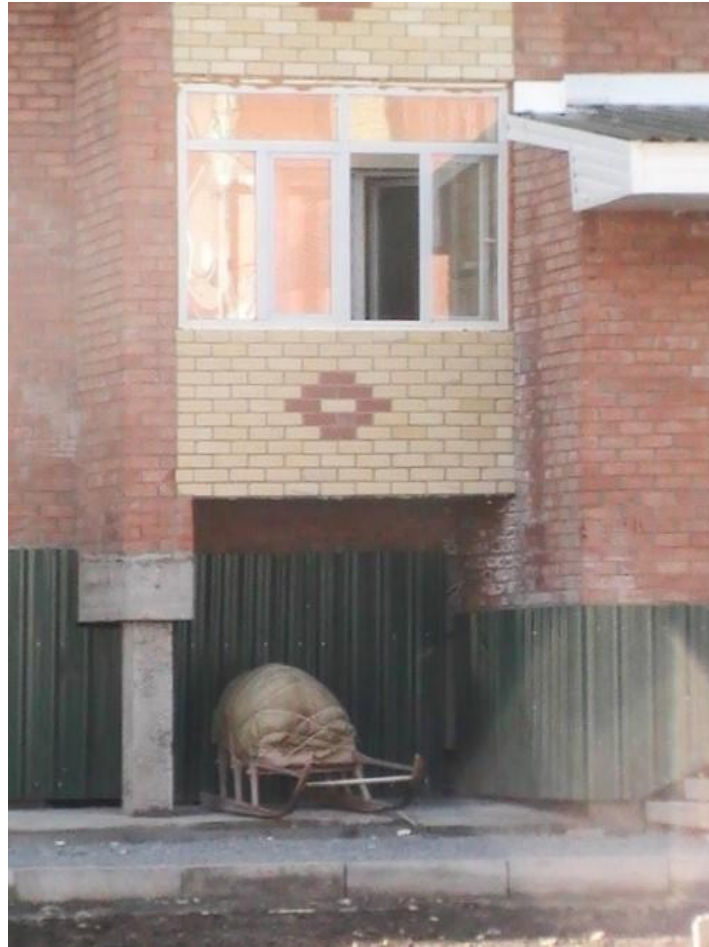
Figure 3: Sedentary life in the settlement

This process is similar to that described by Marx and Engels (1848) and Lenin (1899) according to whom the lack of sizable means of production results in members of the 'petty-bourgeois' ("the Nenets" in this case) being under threat of sinking into the 'proletariat' and so by losing independence they become part of the 'means of production' (Ball et al. , 2014); used and discarded as required (Slattery, 2003):