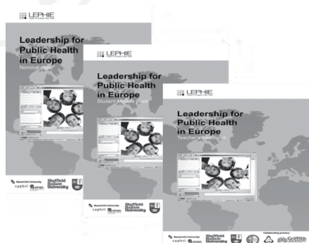
Figure 1. Educational Materials: Nominal Plan, Student Module Book and Teacher’s Handbook.

Since the LEPHIE curriculum is a complex, integrated and multidisciplinary continuing professional education offer we started with the assumption stemming from Merizow’s Transformative Learning Theory. According to this theory learning is “...the process by which we transform our taken-for-granted frames of reference (meaning perspectives, habits of mind, mind sets) to make them more inclusive, discriminating, open, emo-