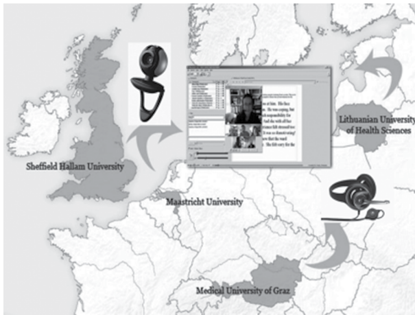
Figure 3. Online collaboration of the educational institutions. Source: Book covers of educational materials based on Czabanowska K., Smith T., et al., Leadership for Public Health in Europe. Nominal Plan , Maastricht University, Maastricht 2013.