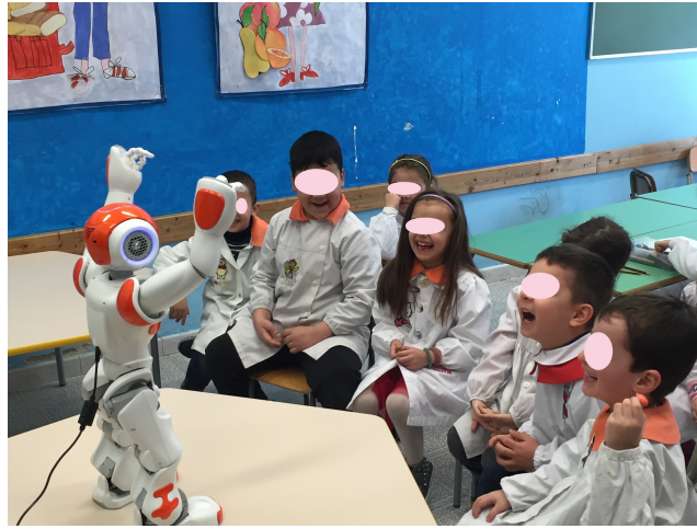
Figure 1. Robot expressive storytelling.

Specifically, the expressive condition was characterized by gestures of the hands, legs and trunk to accompany and mimic the objects and the adventures told in the tale. For example, in the knowledge tale Nao robot clapped his hands while saying “Oh! How beautiful are our Emperor’s new clothes! What a magnificent train there is to the mantle; and how gracefully the scarf hangs!”, and in the emotional tale case Nao robot bent its head down after saying at a lower pitch “Kill me! Said the poor creature”. Moreover, the robot’s eyes changed colour (green, red, blue or white) according to specific situations, e.g. red for danger, at the same time the voice modulated the pitch, the volume and the emphasis on the words spoken, e.g. a louder voice and higher pitch when introducing the Emperor.