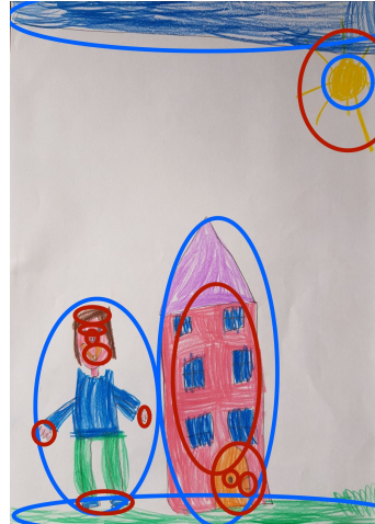
Figure 3. Example the coding of drawings. Elements are circled in blue and details in red. In this case, we counted 5 elements (person, castle, sun, sky, grass) and 11 details (rays, hands, feet, mouth, nose, eyes, hairs, windows, door, handles, viewing hole).

counted in the details and vice-versa. Fewer elements than details were expected to be reported by the children. Figure 3 shows an example of the coding.