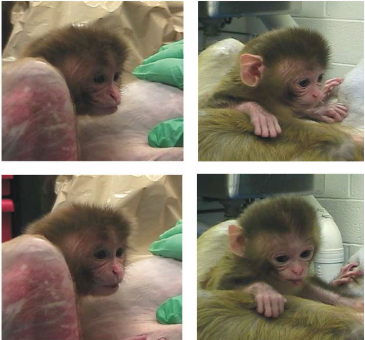
Fig 1. Mother-reared (MR) rhesus macaque newborns during neonatal imitation. The infant on the left is imitating lipsmacking (LS) and the infant on the right is imitating tongue protrusion (TP).