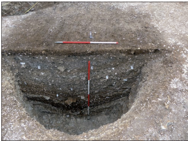
Figure 8: A section through storage pit F62 in Trench F, looking south.

these, which varied between 0.9 and 2.8 m in depth (Fig. 8), incorporated domestic midden waste whilst a few also contained copper and iron working debris. As has previously been noted across the project (Russell et al. 2014, 219), the term 'storage pit' is generally applied to such features although no definitive evidence as to the nature of material being stored has yet been recovered. Presumably, if intended as functional elements within a settlement, such cuts may originally have held dairy produce, in the manner of a cold store, or grain, each pit acting as a silo designed to contain the surplus produce of a single agricultural cycle. Five pits contained special deposits at their base, including a whale vertebra and other placed collections of semi-articulated animal bone (Fig. 9). Additional evidence, revealed during geophysical survey of the surrounding area, suggests