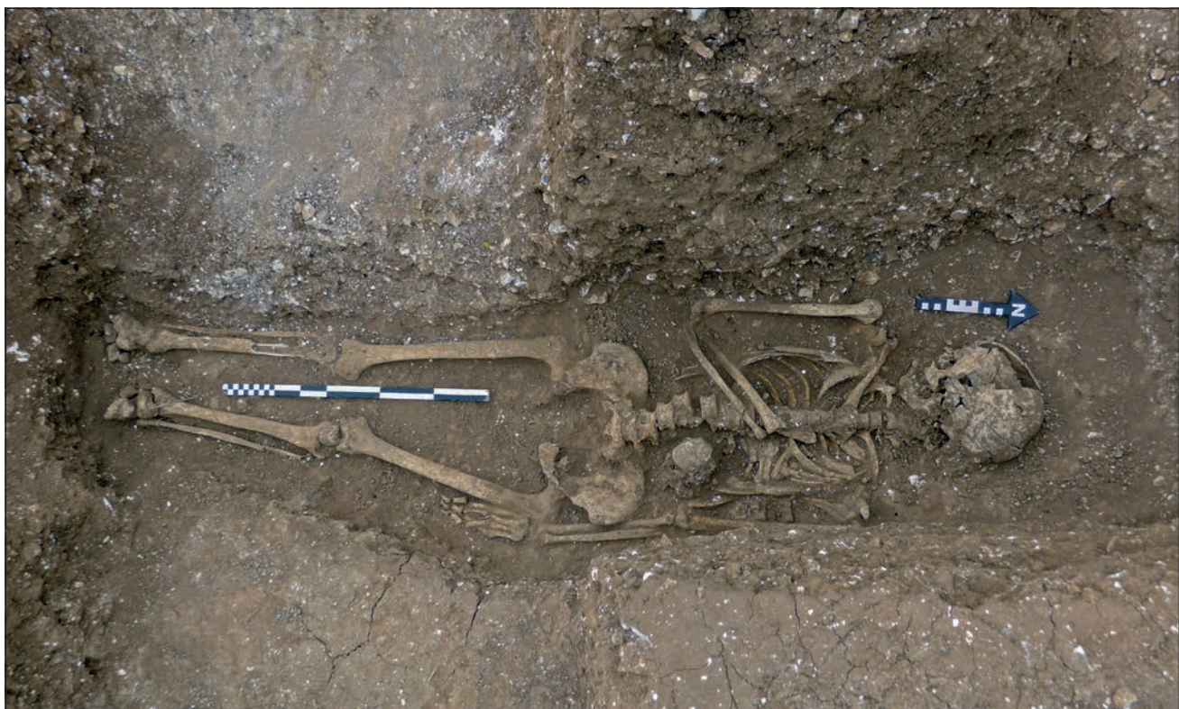
Figure 5: A Later Roman hobnail boot inhumation (F1238) cut into the north-eastern side of the backfilled Later Bronze Age or Early Iron Age ditch cutting across Trench G (Miles Russell).