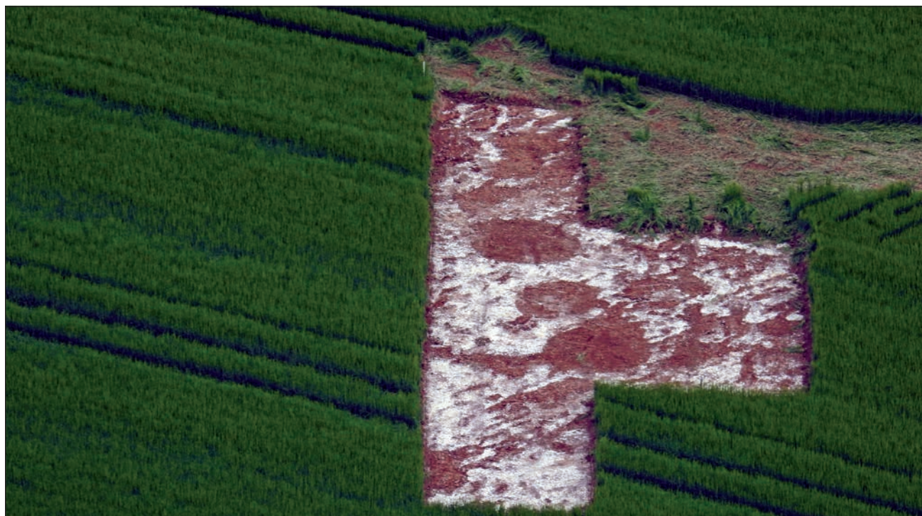
Figure 7: An aerial photograph, looking north-east, of the pit-features in Trench H immediately after machine excavation in May 2017 (Jo and Sue Crane).