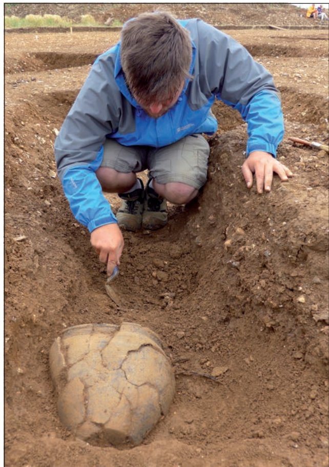
Figure 4: One of a number of complete Later Iron Age jars being excavated from the western fill (F1258) of the Trench G enclosure ditch (Miles Russell).

A single extended shroud burial, dating from the Later Roman period, was found at the north-eastern side of Trench G, cut into the fill of the Later Bronze or Early Iron Age ditch system that preceded the