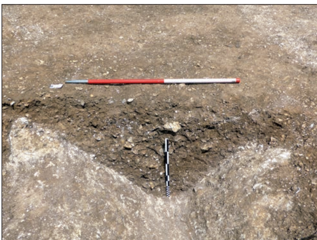
Figure 3: A section excavated across the south-eastern segment of the Later Iron Age enclosure ditch (F1347) in Trench G, looking north-east, demonstrating a single backfilling event (Miles Russell).

in width. No trace of an earthen, and presumably internal, rampart survived. The enclosure partially overlay an earlier ditch, possibly part of a field-system or land boundary, of Later Bronze or Early Iron Age date.