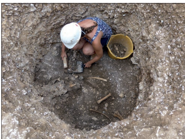
Figure 9: Mixed body parts of horse, cattle and sheep, including some partially articulated limbs, under excavation in the basal deposits of pit F124 in Trench F (Miles Russell).

these, which varied between 0.9 and 2.8 m in depth (Fig. 8), incorporated domestic midden waste whilst a few also contained copper and iron working debris. As has previously been noted across the project (Russell et al. 2014, 219), the term 'storage pit' is generally applied to such features although no definitive evidence as to the nature of material being stored has yet been recovered. Presumably, if intended as functional elements within a settlement, such cuts may originally have held dairy produce, in the manner of a cold store, or grain, each pit acting as a silo designed to contain the surplus produce of a single agricultural cycle. Five pits contained special deposits at their base, including a whale vertebra and other placed collections of semi-articulated animal bone (Fig. 9). Additional evidence, revealed during geophysical survey of the surrounding area, suggests