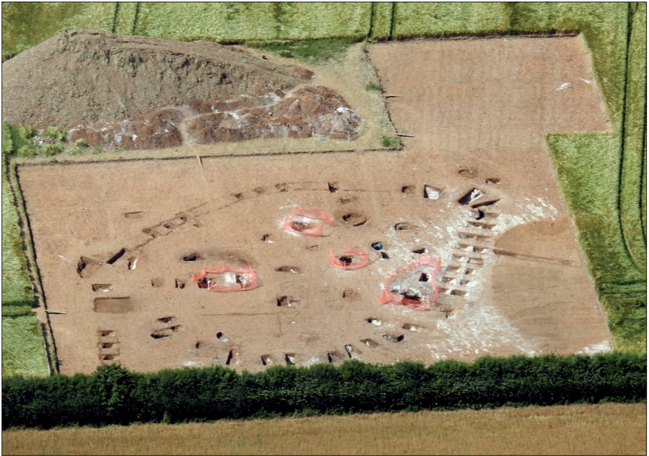
Figure 2: An aerial photograph, looking north north-east, of Trench G, showing the ditches and pits of the Later Iron Age polygonal enclosure under investigation in July 2017.