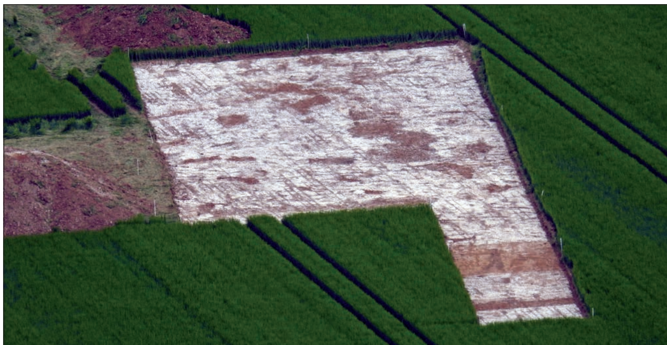
Figure 6: An aerial photograph, looking north, of Trench F in May 2017, immediately after machine excavation has exposed the various pits, ditches and other features. Note the very wide linear ditch (F7) cutting across the trench in the foreground.

Additional trenches (F and H) dug 400 m to the north of the polygonal Iron Age enclosure exposed an area of Later-Bronze and Early Iron Age settlement dominated by a large number of cylindrical cuts (Figs. 6 and 7), 15 of which were either sampled or completely excavated. Where examined, the fill of