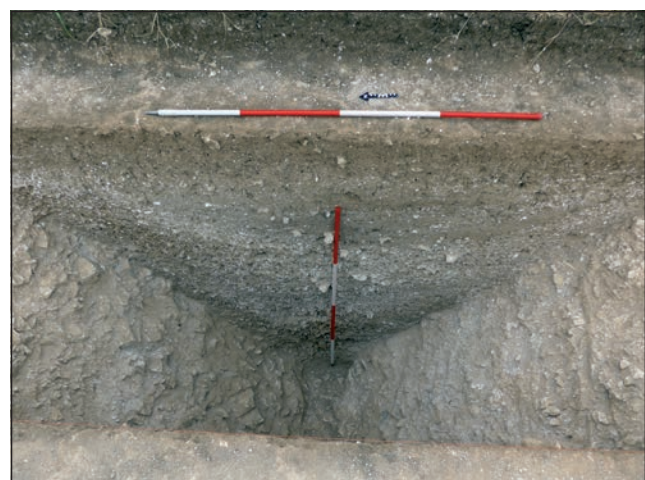
Figure 10: A section through the larger of the two linear ditches (F7) at the southern edge of Trench F, looking east (Miles Russell).

Finds from the 2017 season significantly expand the timescale of activity recorded during the Durotriges Project across this south-east-facing hillside at Winterborne Kingston, from the upper Palaeolithic through to the Later Medieval period. All material has now been taken back to Bournemouth University for further analysis, and the site has been backfilled.