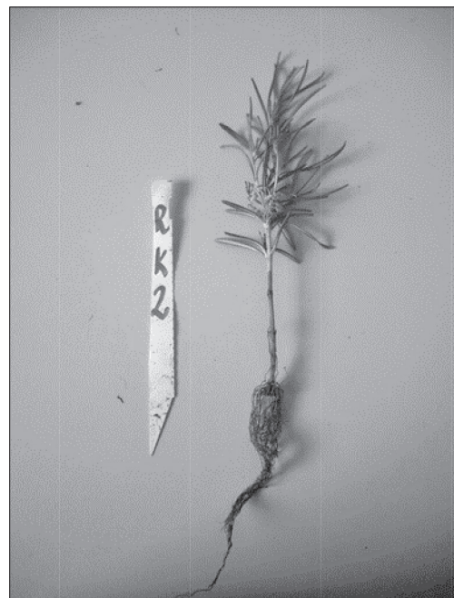
Figure 3. Development of treated with hormone (RA2) and untreated (RK2) cuttings of R. officinalis

Slika 3. Razvoj tretiranih renica (RA2) R. officinalis s hormonom i netretiranih (RK2)