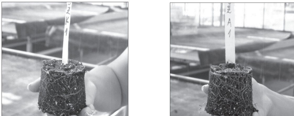
Figure 4. Root development of treated with hormone (ŽA2) and untreated (ŽK2) cuttings of S. officinalis

Slika 4. Usporedba razvijenosti korijena tretiranih renica (ŽA2) S. officinalis s hormonom i netretiranih (ŽK2)