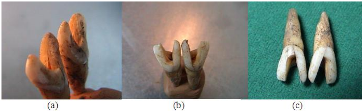
Figure 4 (a,b,c). V-shaped dental mutilations in the upper two incisor anterior teeth.