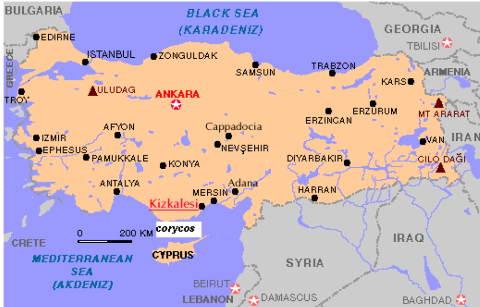
Figure 1. The location of Corycus (Kiz Kalesi-Maiden's Castle).

31. Halberstein RA. Medicinal plants: historical and cross-cultural usage patterns. Annals of Epidemiology 2005;15:686–99.