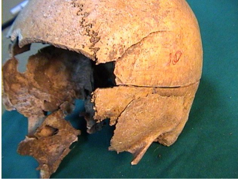
Figure 3. Deep cuts and puncture on a skull found at Corycus.