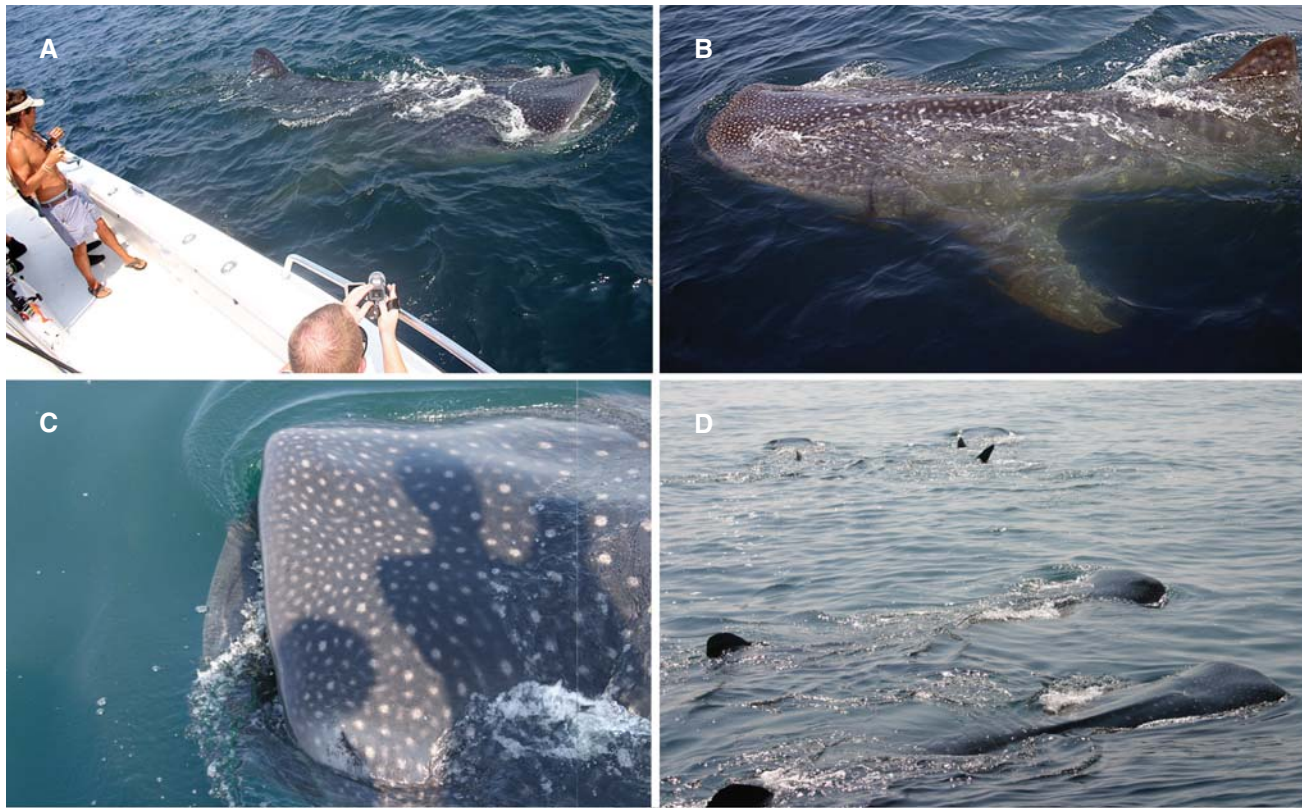
Figure 2. Images showing whale sharks, Rhincodon typus , feeding on 26 June 2006 in the north central Gulf of Mexico. A) Total lengths were estimated by aligning the 11 m vessel with the shark and estimating size. B) Whale shark swimming horizontally showing ram surface filter feeding. C) Close up of a whale shark mouth while surface ram filter feeding; upper jaw is above the water's surface while the lower jaw is submerged. D) An image of 2 whale sharks swimming adjacent and parallel in the foreground and background.

A subsample of the eggs was examined to determine size (diameter, mm) and developmental stage (Kendall et al. 1984) using an Olympus dissecting microscope equipped with a calibrated ocular micrometer. A gross microscopic survey of the zooplankton sample was performed to identify component species (Smith and Johnson 1996).