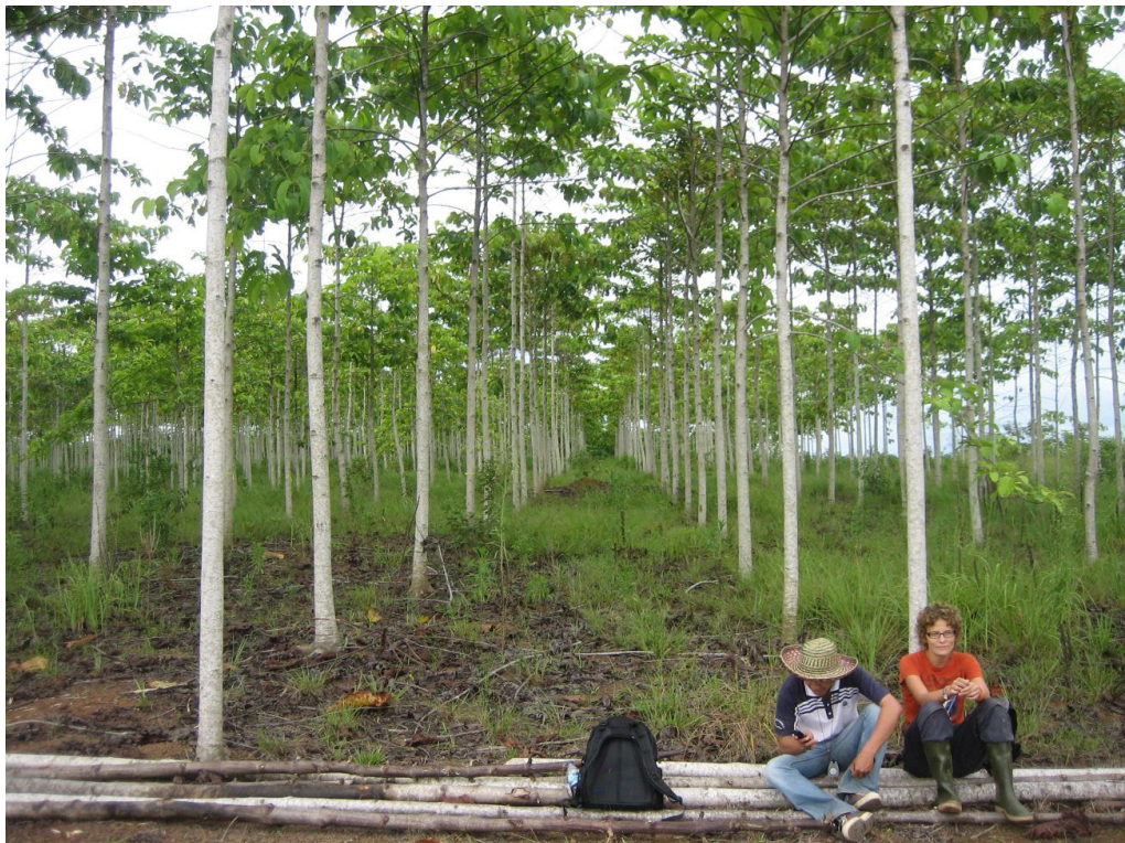
Figure 3. Anthocephalus cadamba (kadam) plantation in Jorong Village, South Kalimantan.

Kadam is a fast growing species (e.g. Soerianegara and Lemmens 1993, Orwa et al. 2009), however, few reliable experimental data are available to support this argument (Krisnawati et al. 2011b). An average DBH of up to 23.9 cm and a mean height of up to 17 m were recorded for kadam trees up to four years old growing in an experimental plot in Indonesia ( http://www.papadaanfoundation.com /tabel-pertumbuhan ). For trees older than 10 years, the mean DBH across several sites in Java ranged from 18.6-42.3 cm, with a mean value of 29.3 cm. In West Java, kadam trees were reported to have an average height of 22 m and an average DBH of 40.5 cm in a 10.5 year-old stand (Soerianegara and Lemmens 1993). Soerianegara and Lemmens (1993) also reported that in a 30-year rotation in Indonesia, kadam produced 23 m 3 ha -1 year -1 (including thinning). In Java, Sudarmo (1957) found that kadam reached a maximum volume MAI of 20 m 3 ha -1 by the age of 9 years in good quality sites. No serious diseases have been reported for kadam in Indonesia (Soerianegara and Lemmens 1993).