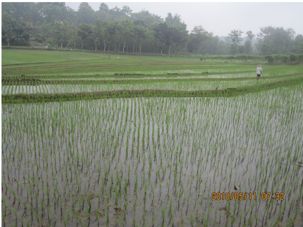
Figure 11. In Central Java the main land use activity was paddy rice; but teak plantations can be seen bordering the rice fields.