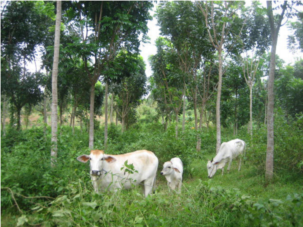
Figure 10. Cows were able to pasture between the widely planted mahogany trees, Ranggalang Village, South Kalimantan.