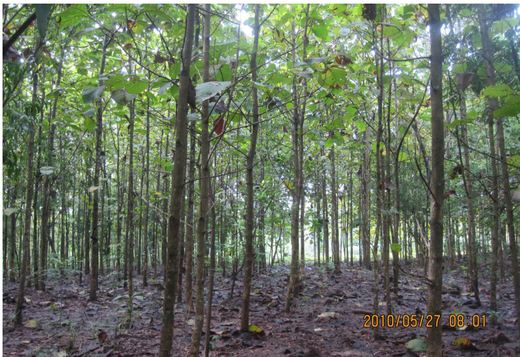
Figure 5. Teak plantation in Sendangijo Village, Central Java.

Teak does not suffer of major pressures in terms of susceptibility to pests and diseases in Indonesia. Teak can be infected by bacteria such as Pseudomonas solanacearum and fungi such as corticium salmonicolor . It can also commonly be attacked by wood borers (such as Monohammus rusticator or Xyleborus destruens ), leaf eating caterpillars ( Pyrausta machaeralis or Hybleae puera ), tree termite Neotermes tectonae , or infested by semi-parasitic mistletoes ( Loranthus spp. ) (Soerianegara and Lemmens 1993). The various pests and diseases may be controlled by, for example, removing the sick trees, proper thinning, or by chemical control (Pramono et al. 2012).