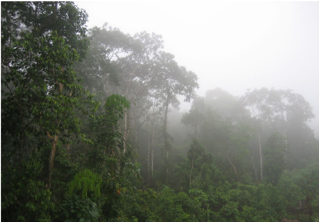
Figure 8. The study area in Riau, Sumatra is still relatively forested compared to the other study sites. The forest areas around the villages are diverse and have been enriched by the local people with several fruit species and jungle rubber ( Hevea brasiliensis ).

Forest plantation development in Sumatra and Kalimantan also has to compete with oil palm and rubber plantations, with the oil palm sector in particular receiving a variety of government incentives that make it a very attractive land-use option (Potter and Lee 1998). The rubber plantations are either monoculture plantations or diverse "jungle rubber" systems (Figure 8), where a variety of native and multipurpose species - including fruit trees - are planted or enhanced to regenerate naturally (Nawir 2007). Other rehabilitation and afforestation programs, such as GERHAN, have also been taking place in both Java and the outer islands; but unfortunately most of the trees in the plantations associated with this program have had poor survival rates (Guizol and Aruan 2004).