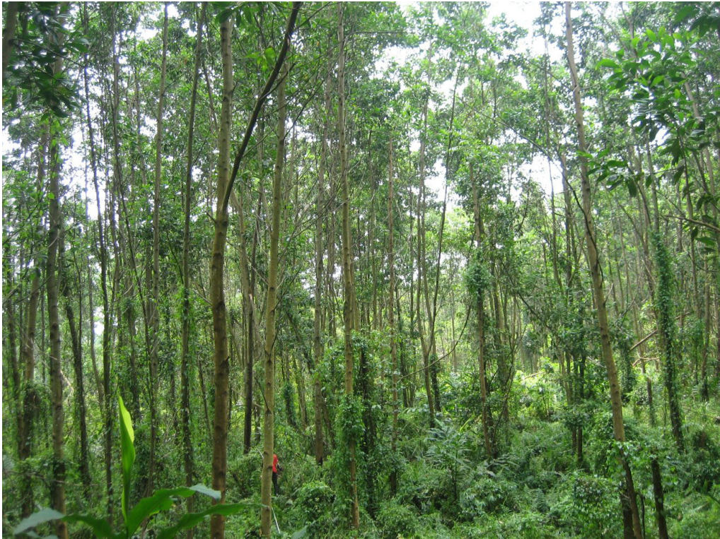
Figure 2. Acacia mangium (acacia) plantation for pulp production in the study site in Riau, Sumatra.