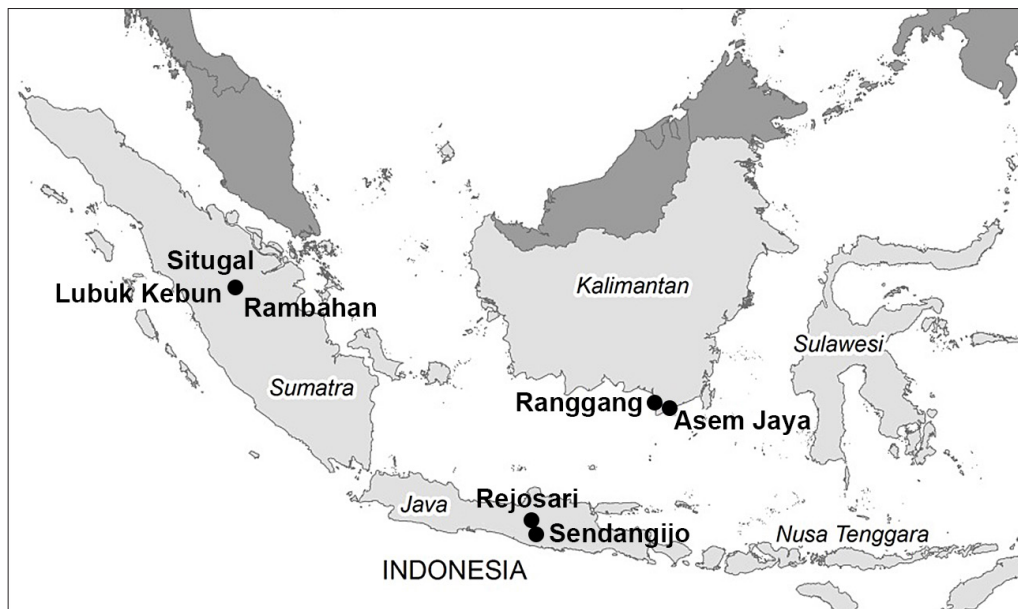
Figure 6. The study sites in Java, Sumatra and Kalimantan islands.