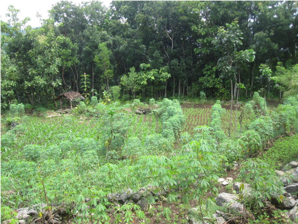
Figure 7. Diverse land use systems are found in the fertile soils of Central Java, with teak playing an important role; being planted inside and around agricultural systems.

The islands of Sumatra, Kalimantan and Papua were, until relatively recently, covered by extensive forests that accounted for approximately 80% of Indonesia's total natural forest area. In 1950 for example, Indonesia's forest cover was estimated to be 162 M ha, or 84% of the total land area (Hannibal 1950, cited in FWI/GFM 2002), whereas today's figures are close to half of that (FAO 2011). These forests were, and still are, amongst the world's most biologically diverse forests. Although there are still vast areas of natural forest remaining in Indonesia's outer islands compared to Java, since the 1980s this area has been deforested or degraded at an alarming rate, and will continue to do so as they provide a cheap source of wood and land (Davis 1989, Guizol and Aruan 2004). Currently, the most degraded forest areas in Indonesia are located in Sumatra and Kalimantan, where a concentration of logging operations conducted by private companies with government authorized concessions (e.g. HPH – Hak Pengusahaan Hutan) have been taking place (Nawir 2007). The highest deforestation and degradation rates (and industrial plantation development) in Sumatra are concentrated in the province of Riau, whilst the highest concentration of degraded areas in Kalimantan are in Central Kalimantan (Nawir 2007).