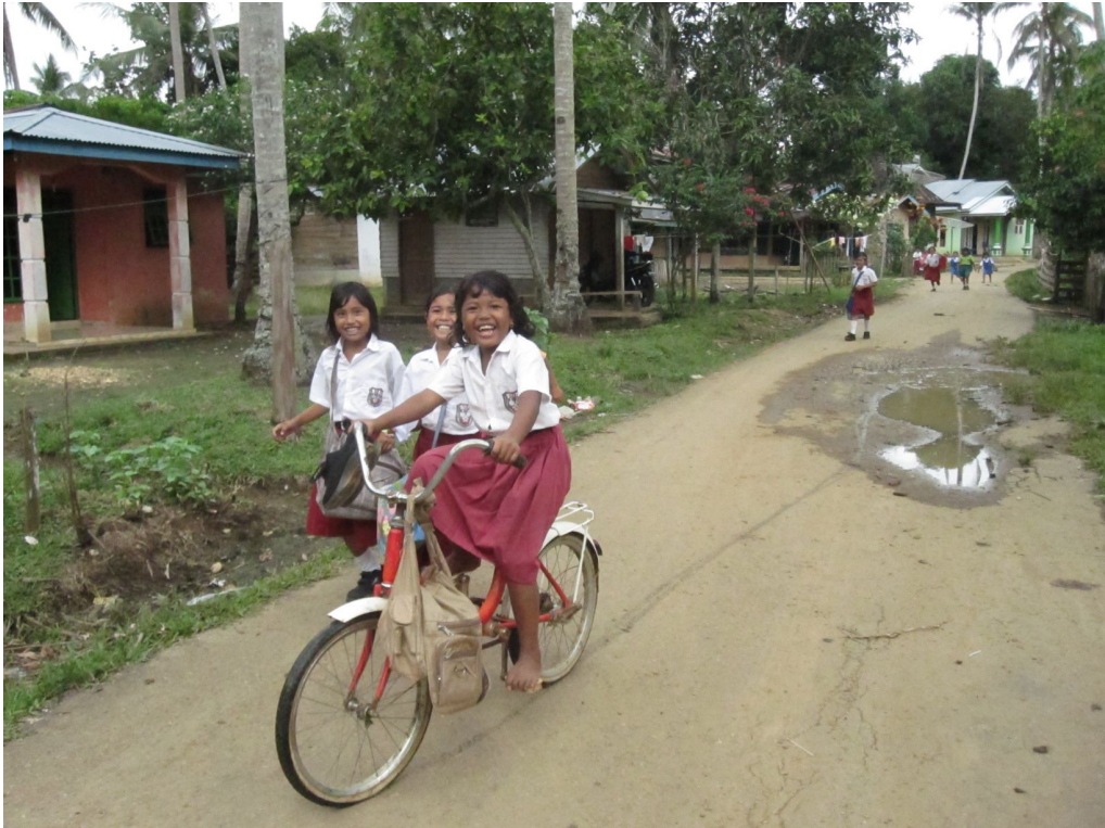
Figure 9. Some of the incentives provided by the pulp and paper company benefited all the villagers, such as the development of the village road, Riau, Sumatra.