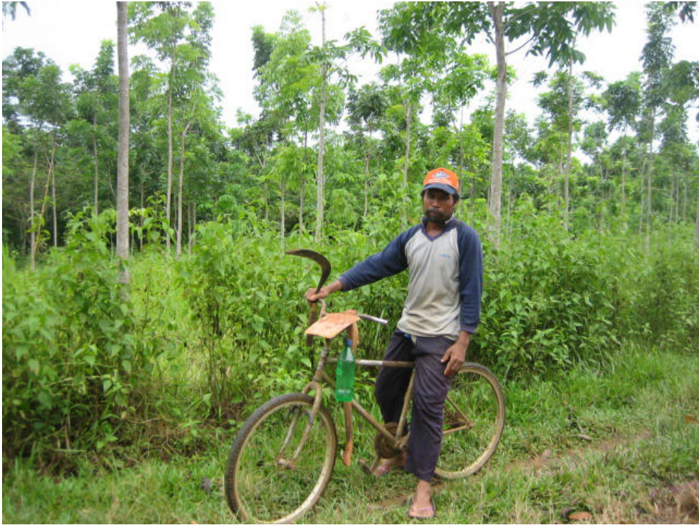
Figure 4. Swietenia macrophylla (mahogany) plantation and the farmer in Ranggang Village, South Kalimantan. Trees are often planted with wide spacing so that other crops or grass can be planted inbetween.