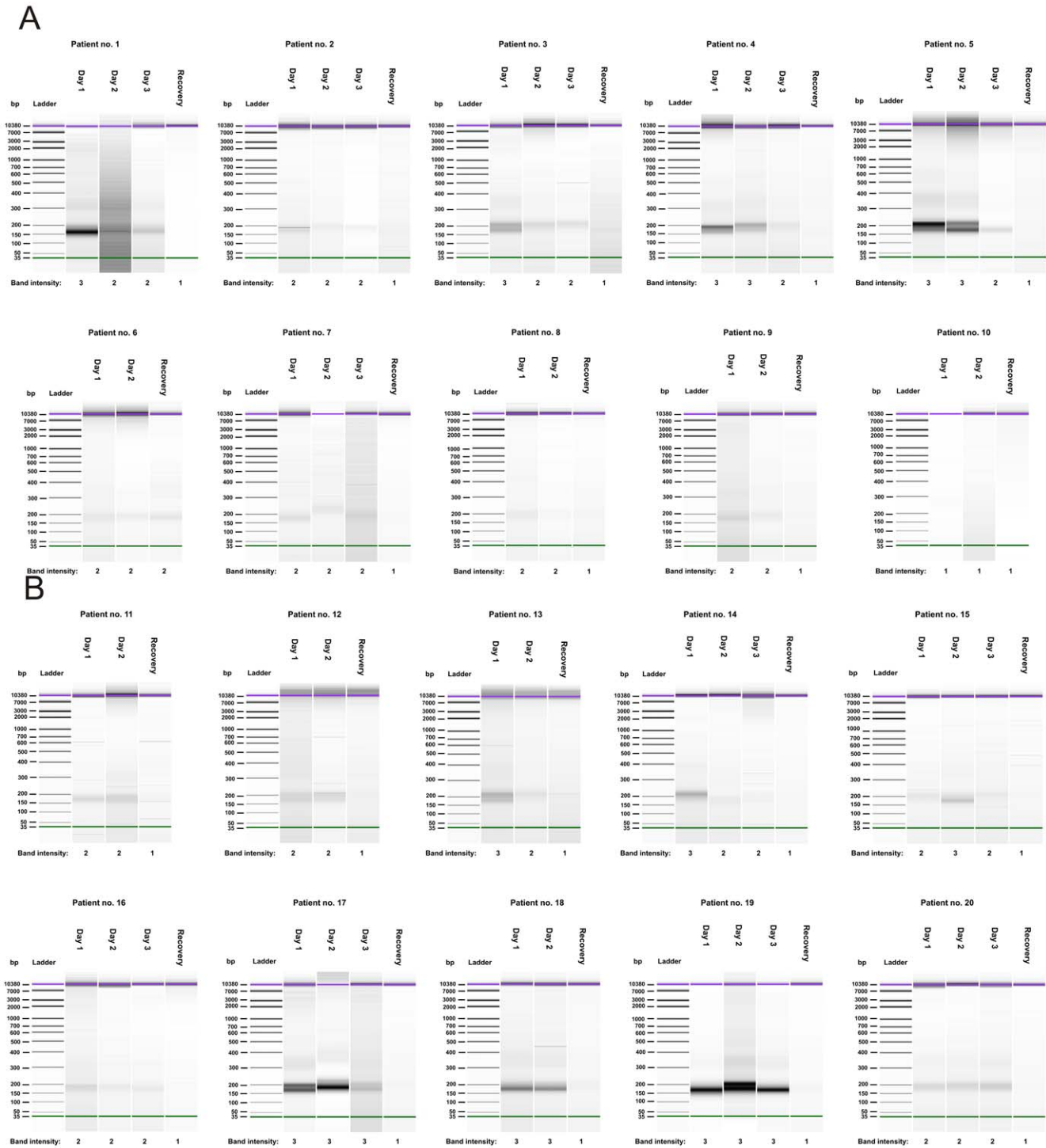
Figure 1. Qualitative analysis of plasma cf-DNA in 10 patients with maximum plasma creatinine >370 µmol/l (A) and 10 patients with maximum plasma creatinine <125 µmol/l (B) after NucleoSpin® Plasma XS kit extraction. Analyses were performed with Agilent’s High Sensitivity Lab-on-a-chip DNA assay. Green lines indicate the low weight (35 base pairs (bp)) DNA marker and purple lines the high weight (10 380 bp) DNA marker. The intensity of low-molecular weight cf-DNA band was graded as follows: 1 = no visible cf-DNA or weak band intensity, 2 = intermediate band intensity, 3 = strong band intensity. doi:10.1371/journal.pone.0031455.g001

Qualitative analysis of urine-cf-DNA revealed that in contrast to plasma, no distinguishable low-molecular weight (150–200 bp)