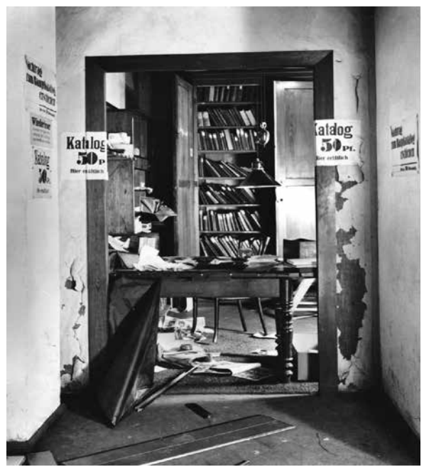
Destructions in the Trade Union House Engelufer by the SA, Berlin 1933