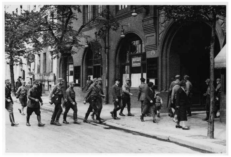
Occupation of the Trade Union House Engelufer, Berlin 1933 Deutsches Historisches Museum, Berlin