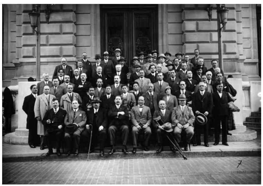
Workers' Group, International Labour Conference, 1933