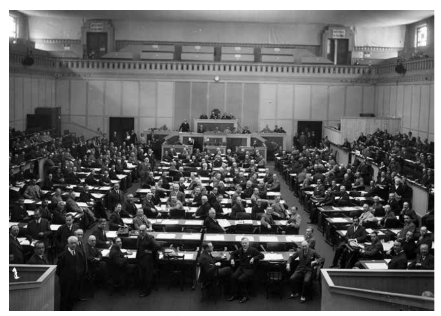
Plenary, International Labour Conference, 1933