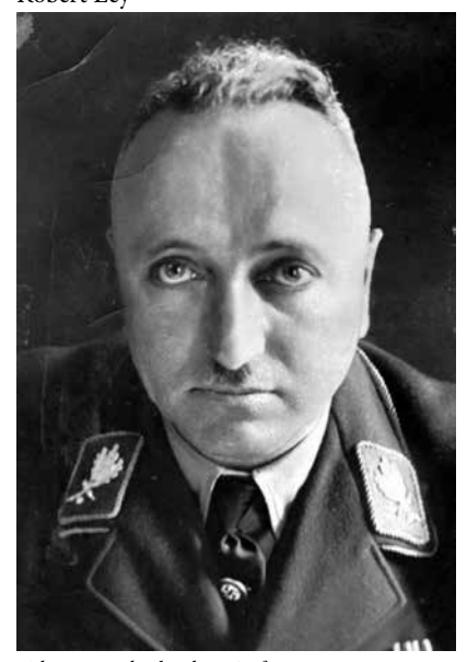
AdsD - Friedrich-Ebert-Stiftung