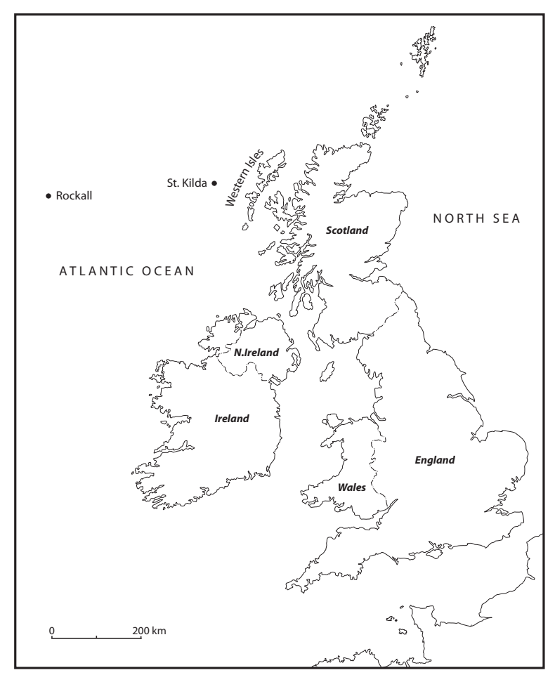
Figure 1 - Rockall and the British Isles

who lost their ship at Rokol in the year 1686, and came in, in a pinnace to St. Kilda ... Upon their landing they pointed to the west, naming Rokol to the inhabitants, and after that, they pointed downward with their finger, signifying the sinking and perishing of their vessel; they shewed them Rokol in the sea map, far west off St. Kilda.