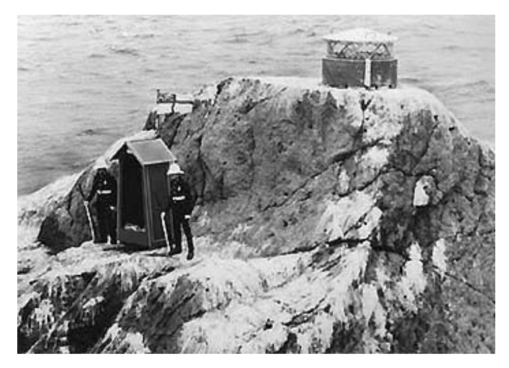
Figure 4 – British Royal Marines guard Rockall in 1974 (internet image, no copyright holder available)

Western Isles council when local government was reorganised in Scotland under the Local Government (Scotland) Act. In a practical demonstration of sovereignty, in 1974 HMS Tartar landed four servicemen on Rockall with, bizarrely, a sentry box and photographs of two Royal Marines in dress uniform standing by the box guarding Rockall were taken.