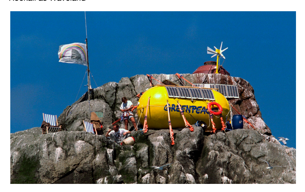
Figure 5 - Greenpeace on Rockall/Waveland, 1997

On 10 June 1997 Al Baker, Meike Huelsman and Peter Morris, members of the environmental pressure group, Greenpeace occupied Rockall. Morris (2007) later stated in a blog that