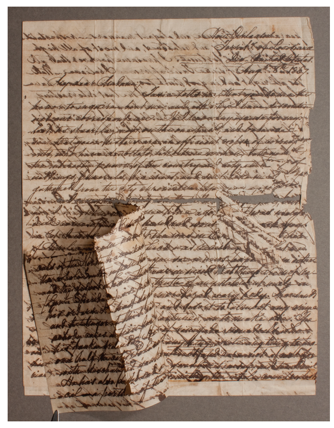
Fig. 4. A manuscript letter with severe iron gall ink damage is one of just two items rejected for digitization by the conservators

For complex items, such as indentures or legal documents with multiple layers or attachments that cannot or should not be separated, we rely upon extra instruction to the scanning technician to ensure the image is captured without incurring damage (fig. 3).