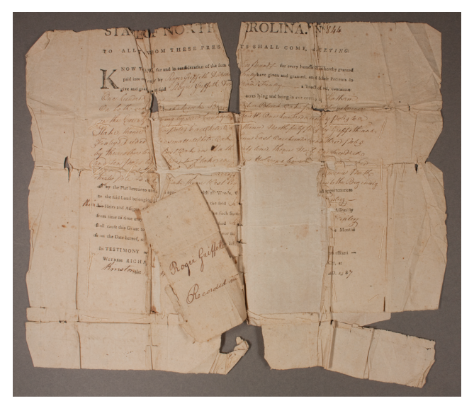
Fig. 1. Before Treatment: 18th century indenture

Other than basic page repair, there are several typical problems that we encounter time and again in these collections, and over time we have adopted practices that streamline preparation. Extremely brittle items and those with extensive losses due to mold, insect, or iron gall ink damage are housed in Mylar and scanned in the sleeve.