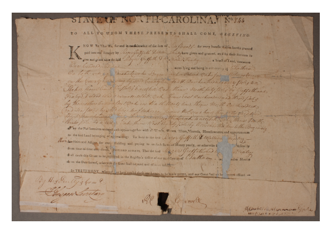
Fig. 2. After Treatment: Indenture stabilized for digitization