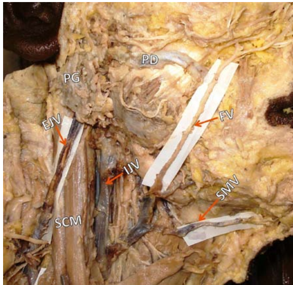
Figure 1: Superficial dissection of the right side head and neck. Superficial dissection of the right side neck showing the external jugular vein (EJV), which is a continuation of the undivided retromandibular vein (not seen in the figure). Facial vein (FV) in the submandibular region joined with submental vein (SMV) and finally terminated in internal jugular vein (IJV). (SCM: sternocleidomastoid muscle; PG: parotid gland; PD: parotid duct).

(CEA) to prevent stroke. Having the detailed knowledge of anatomical variations of the veins of head and neck may be useful in performing these surgical procedures (2).