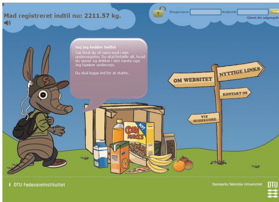
Fig. 2. WebDASC opening screen.

available software Propero Actigraph analysis software (version 1.0.18; http://sourceforge.net/projects/propero/files/ ) was used to analyse the accelerometer data. As recommended by Treuth and colleagues (26), time periods of at least 20 consecutive minutes of zero counts were considered as representing periods when the monitor was not worn or when the child was sleeping and were thus disregarded before analysis. Derived variables were mean counts per min (cpm) based on the vertical axis. Criteria for a successful recording were a minimum of four days of 13 h wear-time per day including at least three weekdays and one weekend day as for the diet assessment.