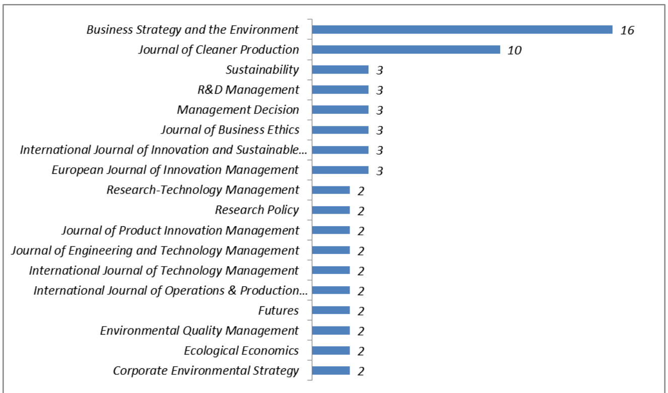
FIGURE 2: JOURNALS PROVIDING 2 OR MORE PAPERS (NUMBER OF PAPERS)