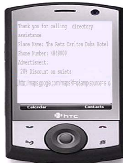
Figure 1: SMS with WAP content on the subscriber mobile handset

The subscriber can choose to select the link in the notification message and start an interactive WAP session where the relevant information can be retrieved and explored (refer to Figure 2).