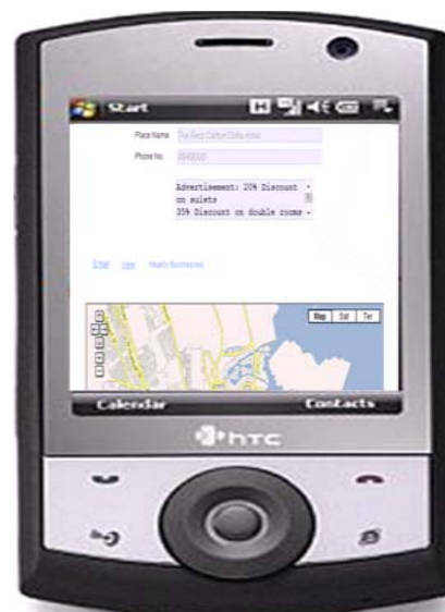
Figure 2: When the WAP link is selected on the subscriber mobile handset

It is also possible to have on-line access to the service described above via a web browser using either a personal computer (PC) or a mobile handset. In this case, a web page containing a search tool will appear to help the subscriber obtaining the desired listing information. This information contains the listing phone number, a digital map, and advertising (if provided). Through the on-line Internet access, the application also gives the subscriber a list of the nearby relevant business listings. In addition, the subscriber will have the option to send the information via an email message.