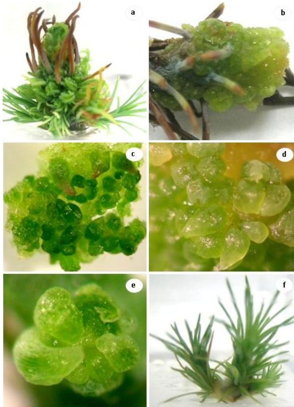
Figure 2. In vitro morphogenesis of Pinus brutia . (a) Direct organogenesis: shoot proliferation with 4.5 \mu\text{M} thidiazuron, (b) callus formation in medium with 3.4 \mu\text{M} paclobutrazol and 9.0 \mu\text{M} thidiazuron, (c) indirect organogenesis: high morphogenetic response of the callus formed, (d) different states during shoot development: elongation of the shoots and shoot apex formation, (e) morphogenic monopolar structures, (f) In vitro isolated shoots.

obtaining 5 shoots per explant on average. Indirect organogenesis has been reported in P. taeda L. (Tang et al., 1998) and P. strobes L. (Tang and Newton, 2005). Tang and Newton (2005) found that at a concentration of 6 \mu\text{M} TDZ, the number of shoots/g callus was 15.7.