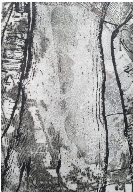
4. Cast fired prior to glazing

One of the main qualities we wanted to replicate from the earlier plaster pieces were the unique marks created by the intaglio surface which were unfortunately being partly lost in this casting process.