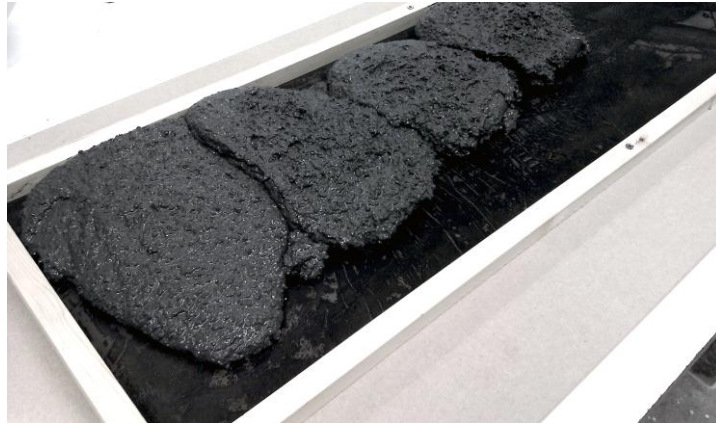
3. Casting onto print plates

This had to be done swiftly as once the concrete begins to set there is little time for manipulation in the moulds. The concrete had to be pressed down into the moulds and air bubbles had to be encouraged to the surface before the concrete set too firmly.