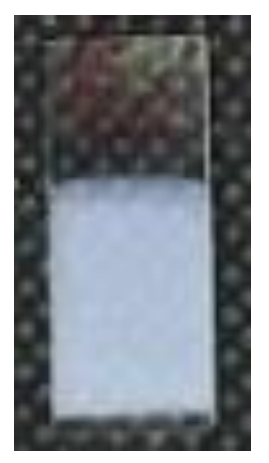
Figure 1 Photograph of electrophoreticallydeposited titania-nanosheets film onto ITOcoated glass substrate (anode). The deposit area was 13 mm x 8 mm.

[1] T. Sasaki and M. Watanabe, J. Am. Chem. Soc., 120, 4682 (1998).