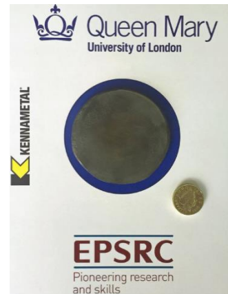
Figure 2 – \Phi 60mm flash sintered SiC sample

Following this recent work, we will present the first attempt of achieving materials flash sintered in contactless mode where the heating rate approaches 10^5 °C/minute. Results on other types of materials (IP pending) may also be presented.