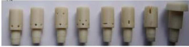
Figure 1: A selection of 3D printed nozzles