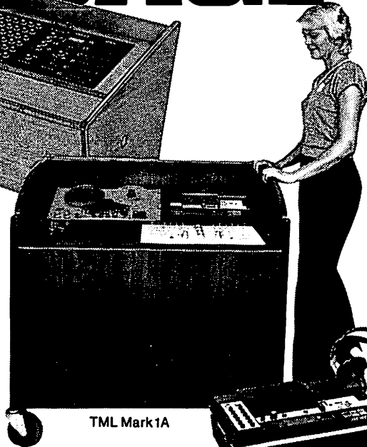
TML Mark 1A

TELEX COMMUNICATIONS, INC. 9600 Aldrich Ave. So., Minneapolis, MN 55420 U.S.A. Europe: 22, rue de la Légion-d'Honneur, 93200 St. Denis, France.