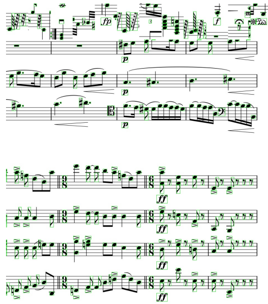
Fig. 3. A musical score where 12 small images have been augmented at the top of 7 regular staves. The bounding boxes are marked in green.

Our current answer to this problem is oversampling rare classes by data synthesis, where we locate rare symbols in the dataset, and during training, we append these symbols at the top of the musical sheets (see Figure 3). More specifically, we augment each input page in a mini-batch with 12 randomly selected synthesized crops of rare symbols (of size 130 \times 80 pixels) by putting them in the margins at the top of the page. Directions on the choice of the creation of augmented symbols are given on [4]. This way, the neural network (on expectation) does not need to wait for more than 10 iterations to see every class which is present in the dataset. At the same time, we have been experimenting with pre-training the net with fully synthetic scores where the classes are fully balanced and then retraining it on the full DeepScores dataset. The two approaches are complementary and preliminary results show improvement, though more investigation is needed: overfitting on extremely rare symbols is still likely, and questions remain regarding how to integrate