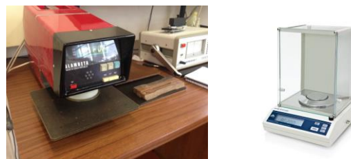
Fig. 3. Alambeta device and analytical balance for thermal and moisture absorption tests, respectively

The moisture absorption test, with an analytical balance, allowed to measure the content of moisture absorbed after 24 hours. The used equipments in both tests are presented in Fig. 3.