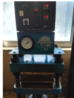
Fig. 2. Molding compression equipment