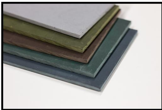
Fig. 5. Composite materials of slate reinforcing bio-epoxy resin

The final composite materials obtained have an aspect like that shown in the Fig. 5, where is demonstrated that it is also possible to obtain materials with different colors using appropriate color pigments.