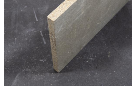
Fig. 6. Viroc product

claddings, flooring, ceiling, furniture, among other applications in construction sector.