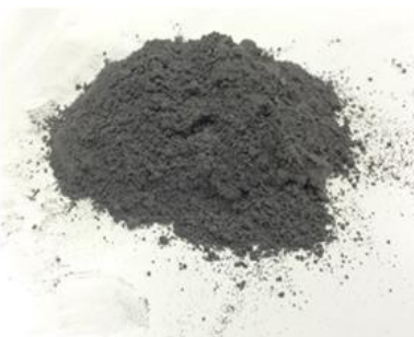
Fig. 1. Mineral dust waste used

Epoxy resin, a thermosetting polymer, was supplied by Sika, reference SR GreenPoxy 56, with up to 56% of its molecular structure coming from plant origin, becoming this polymer an ecological environmentally friendly resin. This percentage is a function of the carbon origin contained in the epoxy molecule. This resin is out coming from the latest innovations in bio-based chemistry. SR GreenPoxy 56 has a density of 1.198 \text{ g cm}^{-3} and a viscosity of 800 \text{ mPa s} at 25^\circ\text{C} .