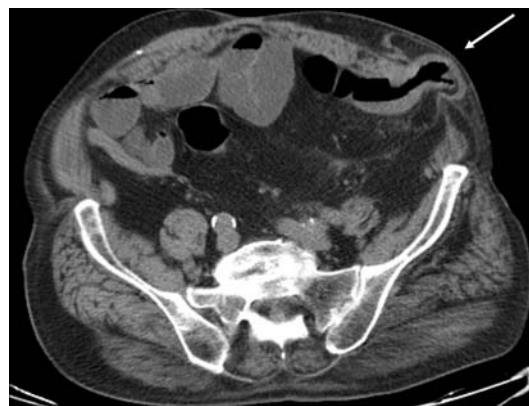
Figure 1 Abdominal CT scan. Left-side Spiegel's hernia with epiploic fat and a segment of the descending colon protruding through the hernia orifice (white arrow).

An abdominal CT scan showed thickening of the descending colon wall and a left-side Spiegel's hernia with epiploic fat and a segment of the descending colon protruding through the hernia orifice (figure 1). However, as the patient had a reducible hernia at physical examination, he was admitted to the ward with the suspicion of ischaemic colitis and put under bowel rest, intravenous