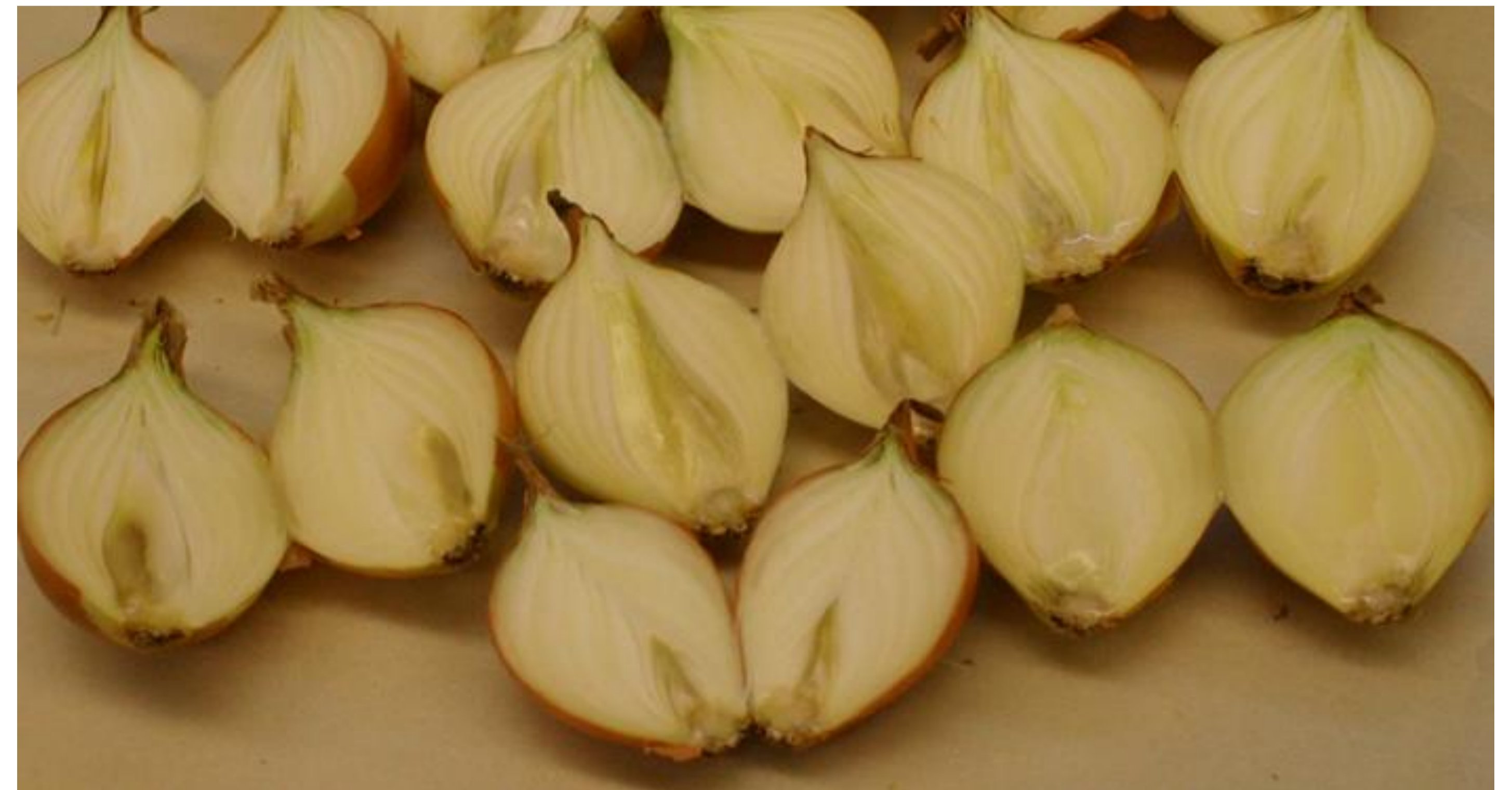
Figure 1. Onions cut into halves two weeks after inoculation with pathogenic Fusarium oxysporum strain.

Maiju ja Yrjö Rikalan Puutarhasäätiö is thanked for funding the project.