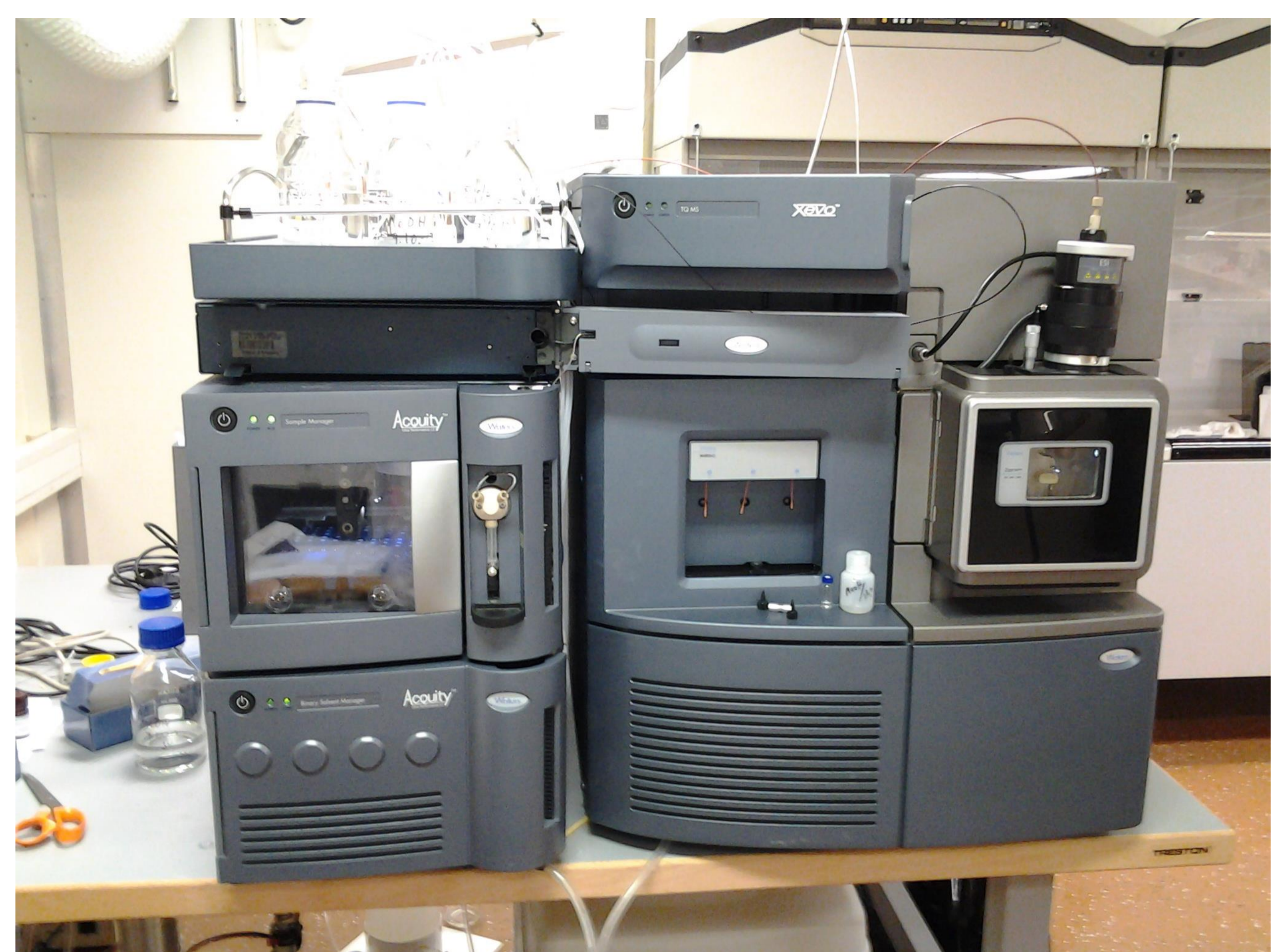
Figure 2. Waters Acquity UPLC - Xevo TQ MS Instrument will be used for identification and quantification of mycotoxins.