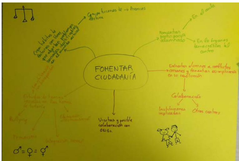
Fig. 1. Mural "Promoting citizenship". Authors: Students participating in the IDA format of the Erasmus+ ELEF programme (Reference number 580426).

Finally, each working group was asked to draw or draw a diagram on a piece of cardboard on what characteristics a program should have in order to be considered a good educational practice that favors democratic and citizen values. A work that was put in common and in which there were many coincidences. The words that represented it were: social values, equality, participation, critical reflection, freedom of expression, dialogue...Some examples of the works presented by the participants are presented below (Figures 1 and 2).