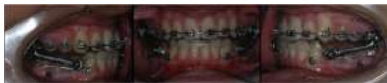
Fig. 1 Herbst appliance with skeletal anchorage

In the test group of 40 patients, a significant ( p < 0.05 ) increase of AD2 was observed after the treatment. Moreover, a significant ( p < 0.05 ) increase of OA and LA was found at T2. An increase of AD1 and AD/PtV was