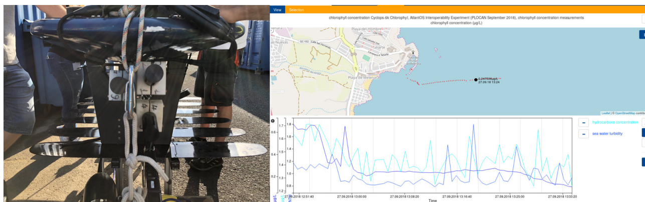
Fig. 2 Sensors installed in the Wave Glider / Data received in real time to the SOS interface

The ATLANTOS Project has received funding from the European Union's Horizon 2020 research and innovation programme under grant agreement 633211.