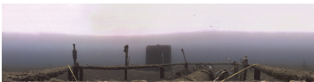
Fig 3. Resulting panoramic image