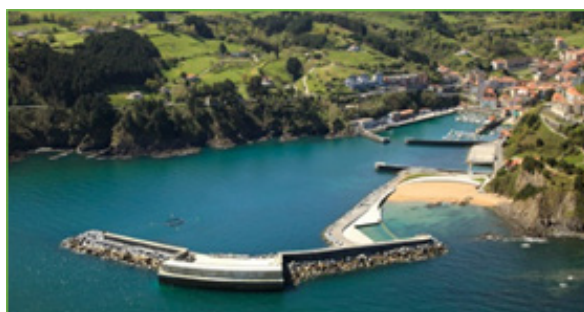
Fig 1. Mutriku Wave Power Plant.

The launch of the first acoustic observatory installed in the Wave Energy Plant of Mutriku took place on the 5th of June 2018. Located in the Bay of Biscay, this wave power plant was inaugurated in 2011 by the Basque Energy Agency, EVE (Fig 1.). The Mutriku Wave Energy Plant ( https://www.bimep.com/pages/mutriku ) is the only infrastructure related to the ocean energies in Gipuzkoa (northern Spain) (Fig.1). It's the first commercial European wave energy plant based on the principle of oscillating water column (OWC) and the only one worldwide connected to the electricity grid. In fact, in June 2018, its 16 turbines reached a cumulative production of 1.6 GWh which was injected into the electricity grid. Since then, the wave energy plant of Mutriku also provides the opportunity to developers to test electric transformation turbines.