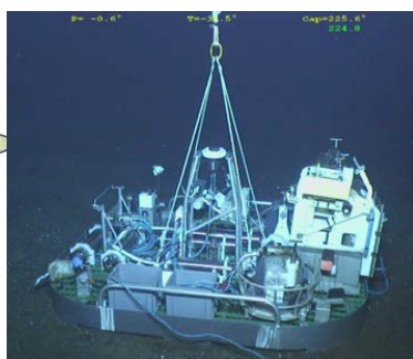
Figure 1 - The EMSO-Azores infrastructure