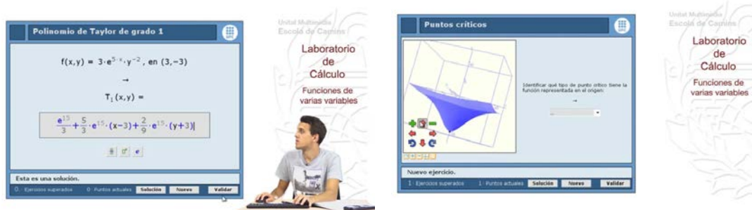
Figure 3: Audiovisual Laboratories