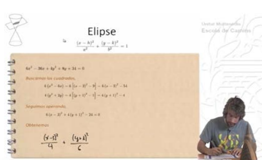
Figure 2: Audiovisual Workshop

The presenters of the motivational videos used a virtual presentation on which it is possible to do explanations, annotations, highlighting specific items... For the release of this second set of videos, for audiovisual workshops, the technology used is considerably expanded.