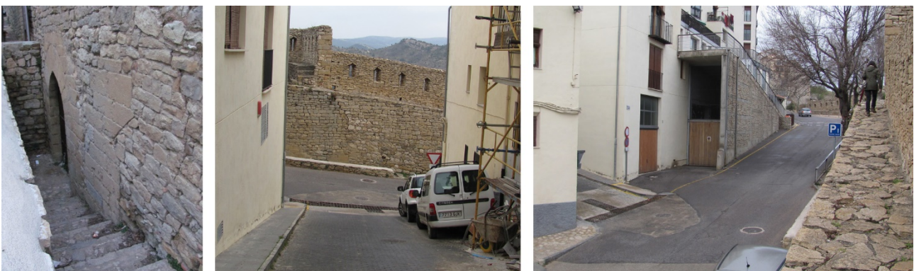
FIGURE 3 The remains of the missing gate; View of the street that goes from the City Hall to the Tower Alòs , currently hidden by the street that is five meters above; View of what was the Aljibe Square;

During war periods it was common to cover the gates to have greater military control. In the History of Morella and its Villages (Segura Barreda 1868) it is explained that the gate Ferrisa was blocked in the Civil War, but it was opened again in 1649, and that the gate La Nevera was blocked at the beginning of the Carlist wars, but it was opened in 1868. The gate Els Estudis was the only one left open in both wars. But the gate Alòs never opened again because an embankment was built that raised the street five meters above.