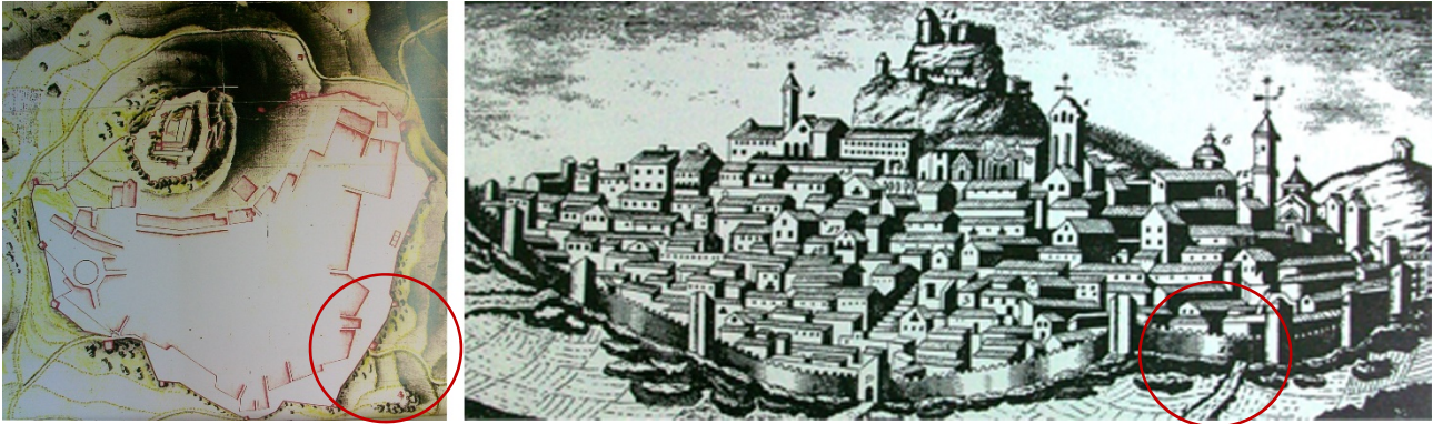
FIGURE 2a. The lost road. Morella 1730.