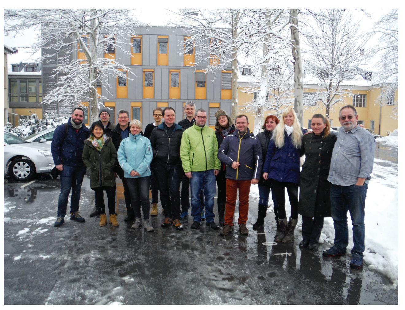
Figure 1. Attendees of the Hackathon joined by COST Action CHARME and ELIXIR.SI representatives.

the primary focus of the meeting was the exchange of substantial knowledge about leading technologies and in situ troubleshooting by solving some real problems.